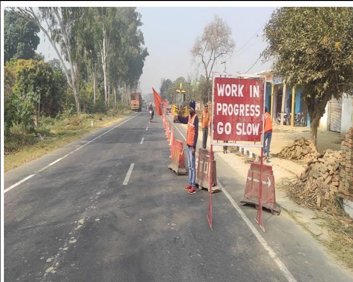
RCC Drain Weep Hole Cleaning is in Progress