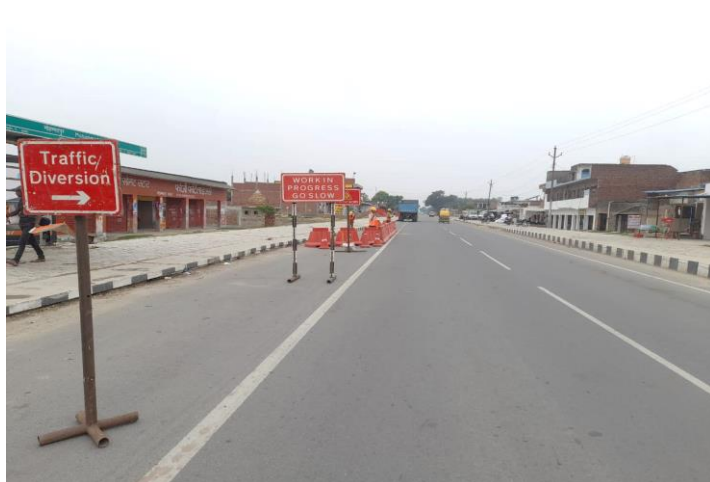
Ch. 47+400 – Road Side Drain and Weep Hole Cleaning Work is in Progress