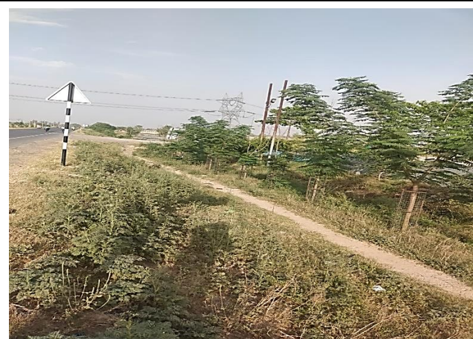
Trees Maintained and Growing