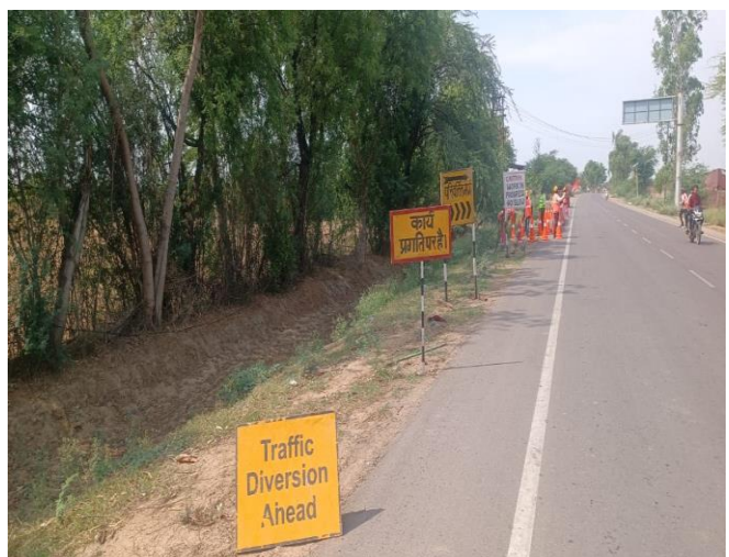
Ch. 32+200 – Rain Cuts and Shoulder Slope Maintenance Work is in Progress