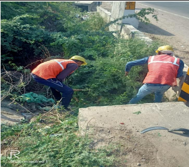
Culvert at Ch. 130+100-Bushes Cutting and Cleaning of Inlet and Outlet