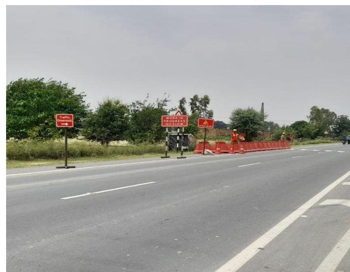
Ch. 41+350 – Shoulder Rectification is in Progress