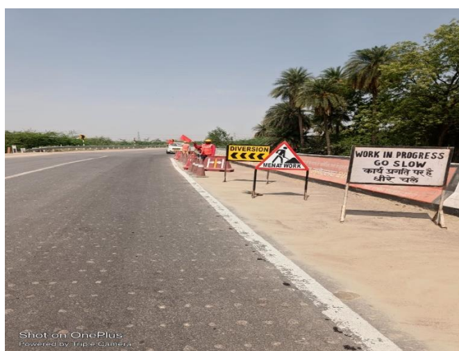
Ch. 125+870 - Cleaning of Minor Bridge is in Progress