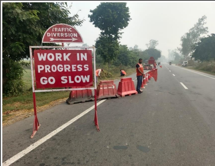
Bushes Cutting Work is in Progress