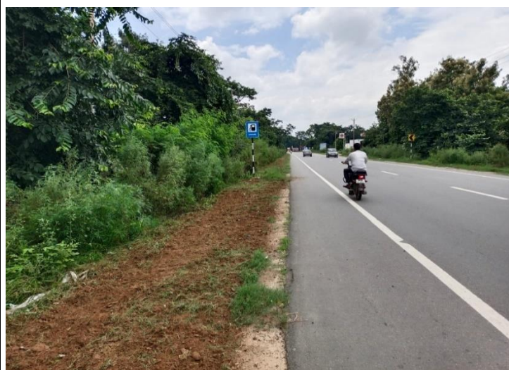
Bush Cutting Work Completed