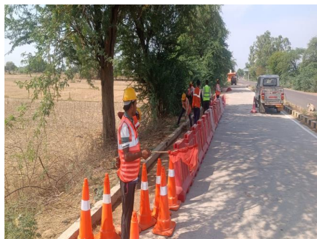
Ch. 53+075 – Truck Lay By Cleaning is in Progress