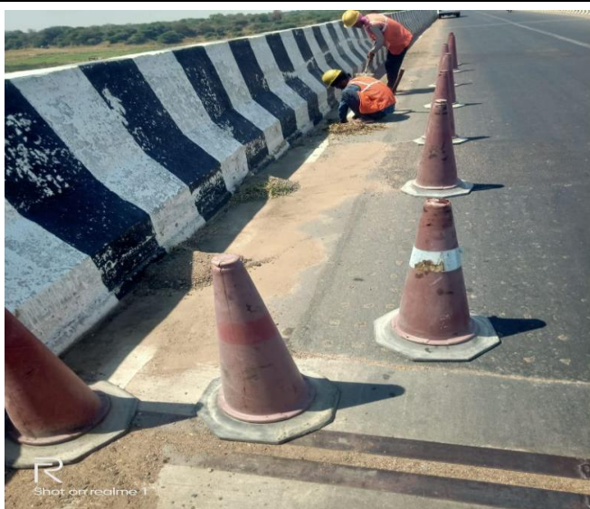
Ch. 158+850 - Paved Shoulder Cleaning Work is in Progress