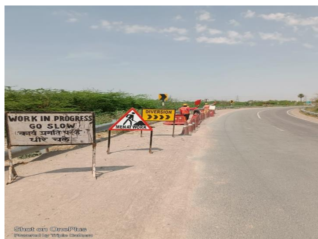
Ch. 125+900 – Cleaning of Paved Shoulder is in Progress