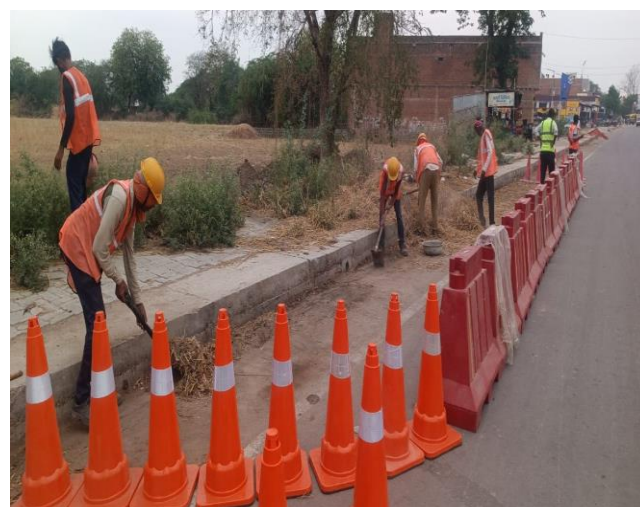
Ch. 51+200 – Road Side Drain and Weep Holes Cleaning in Progress