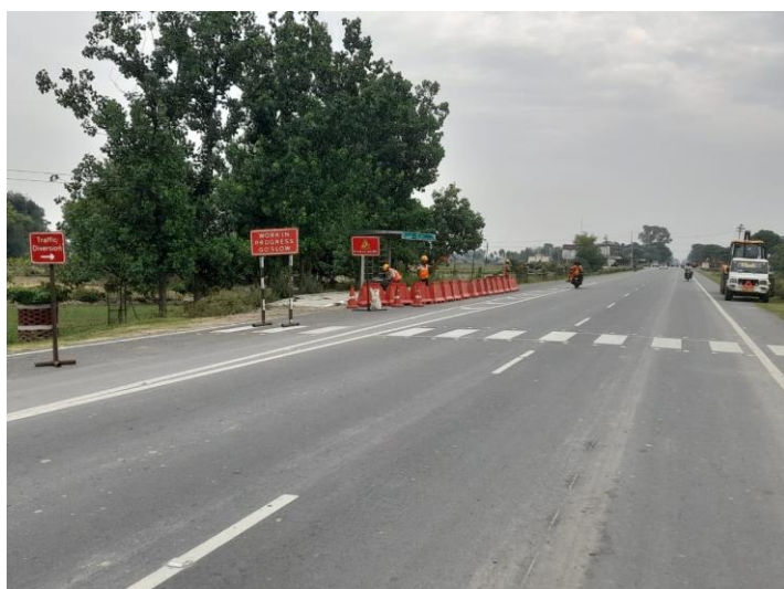
Ch. 40+900 – Bus Lay By Cleaning Work is in Progress