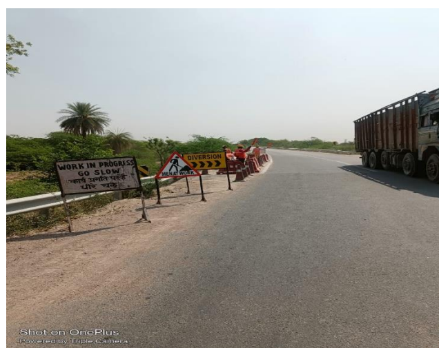
Minor Bridge at Ch. 152+530 – Paved Shoulder Cleaning Work is in Progress