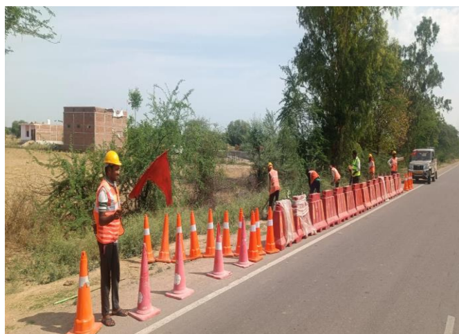
Ch. 43+500 - Bushes Cutting and Clearing Work is in Progress