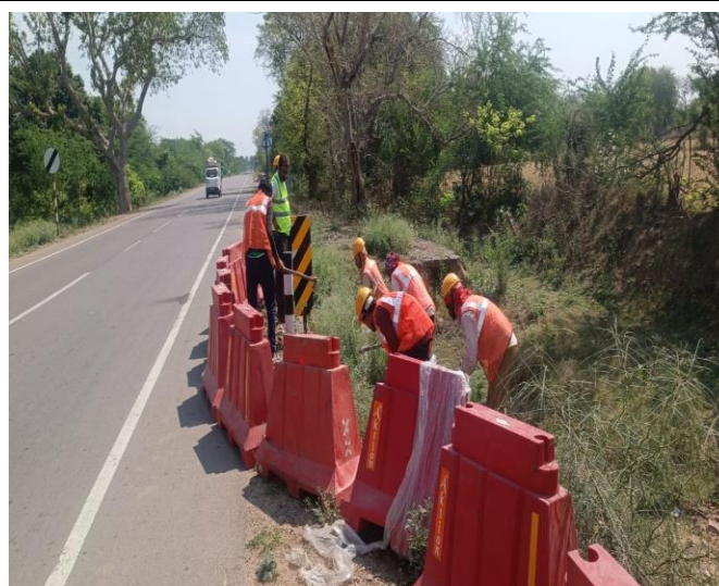
Ch. 54+900 – Culvert Inlets Outlet Cleaning Work is in Progress