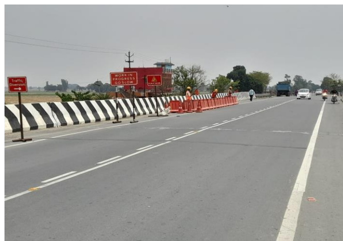
Minor Bridge at Ch. 46+989 – Paved Shoulder Cleaning Work is in Progress