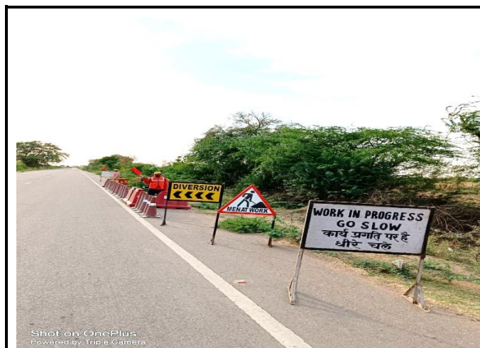
Ch-121+400 – Bushes Cutting Work is in Progress