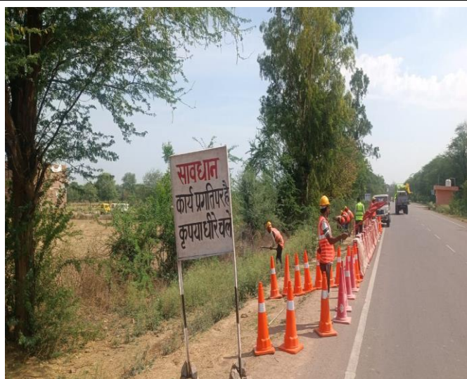
Ch.43+500 – Bushes Cutting Work is in Progress