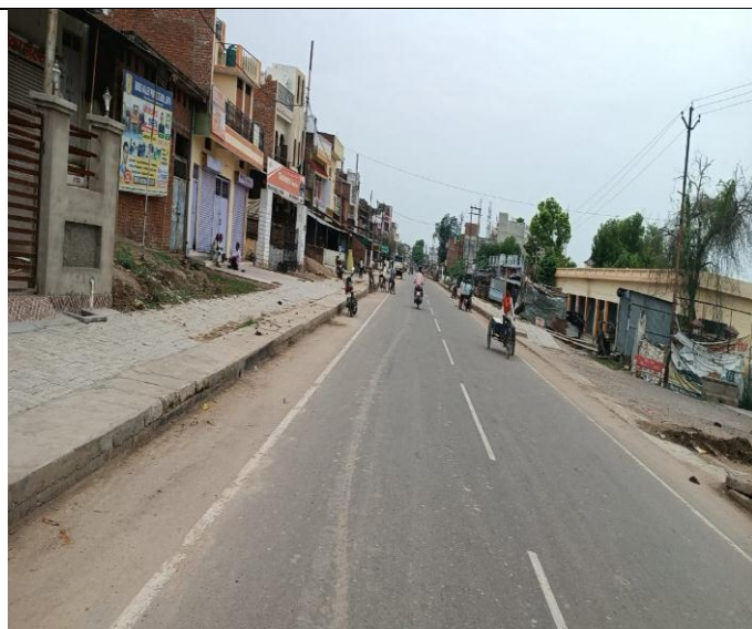
Drain Weep Hole Cleaned