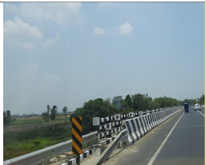
Hazard Board Replaced