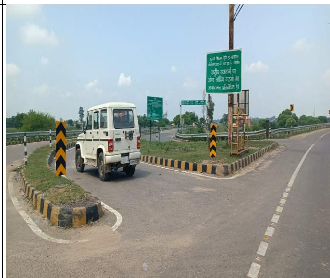
Hazard Board Replaced