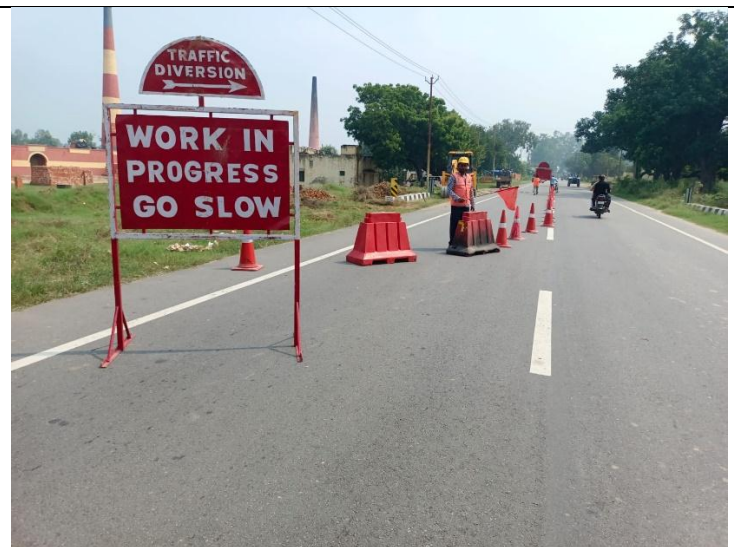
Shoulder Repairing work is in progress