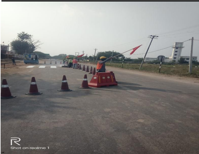
Table top faded road marking repainting is in progress at Ch. 118+925 with safety arrangements