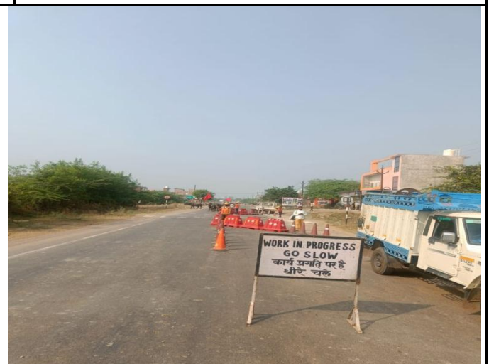
Shoulder cleaning is in progress at Ch. 129+370