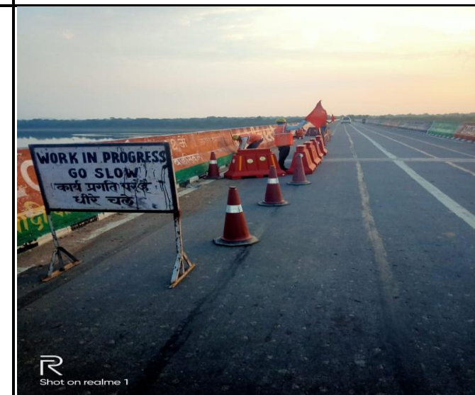
Weep holes Cleaning at Major Bridge