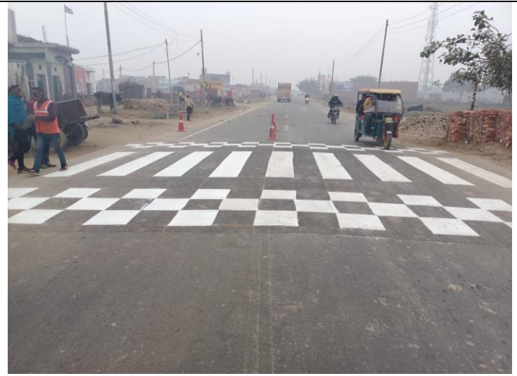
Faded Table Top Road Marking Completed at Ch. 76+080