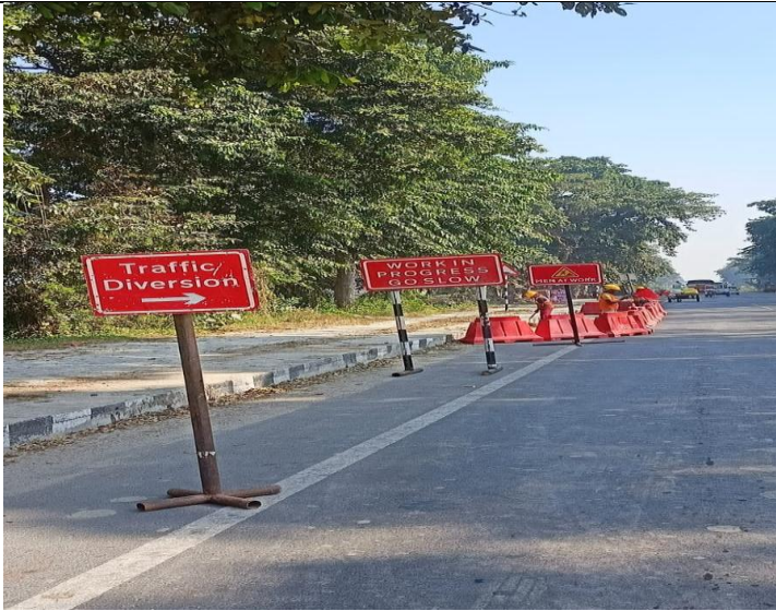
Drain Weep hole cleaning at Ch. 11+300 to Ch. 11+350