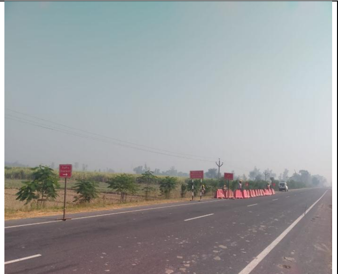
Shoulder repairing works is in progress