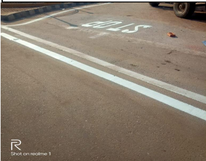
STOP Word Repainted at Gursarai Junction