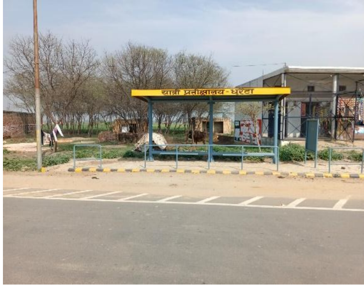
Bus Shelter Cleaned