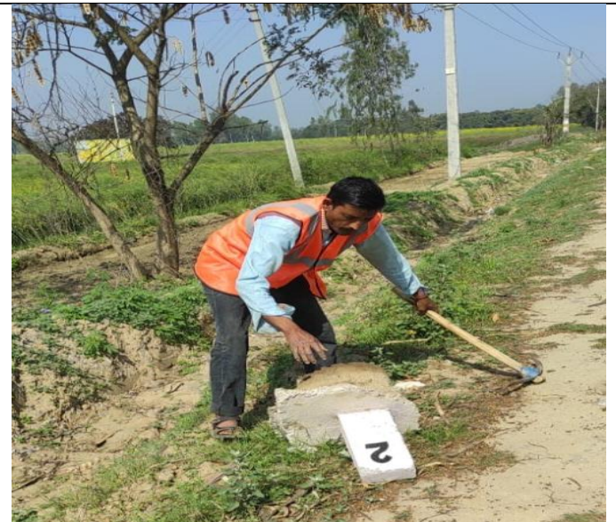
Hectometer Stone Replacing