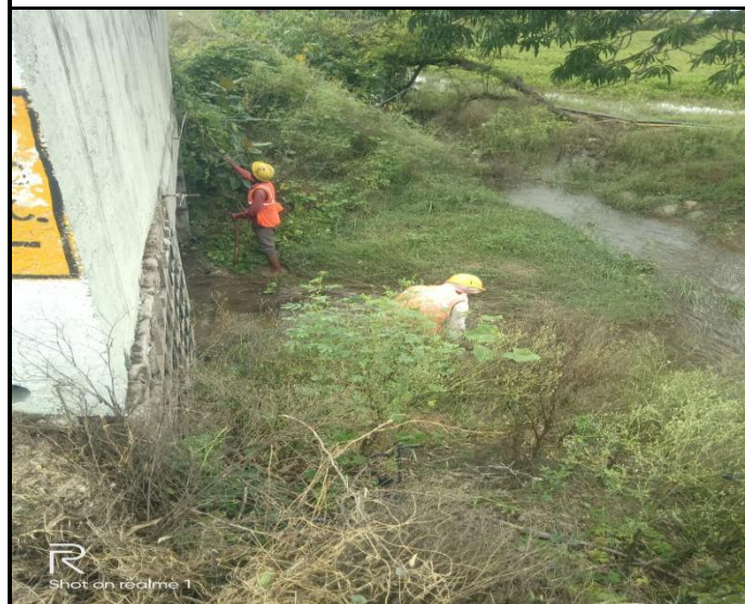
Bushes Cutting Work is in Progress