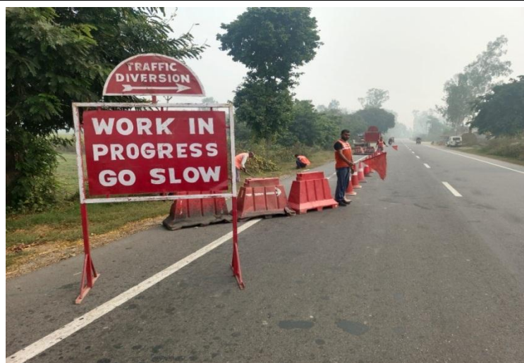
Bush Cutting Work in Progress