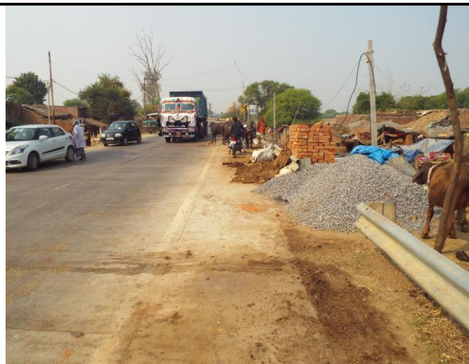
UPG-01 (Hamirpur-Rath) Building Material stored on carriageway