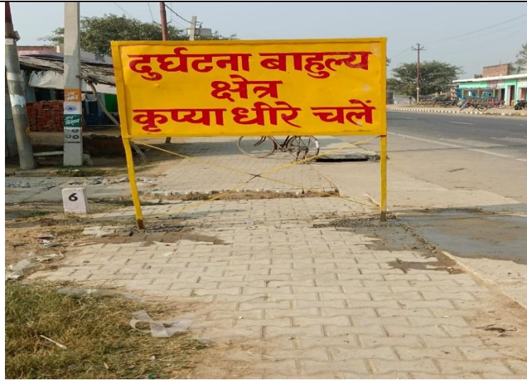
Information Sign Board Refixed