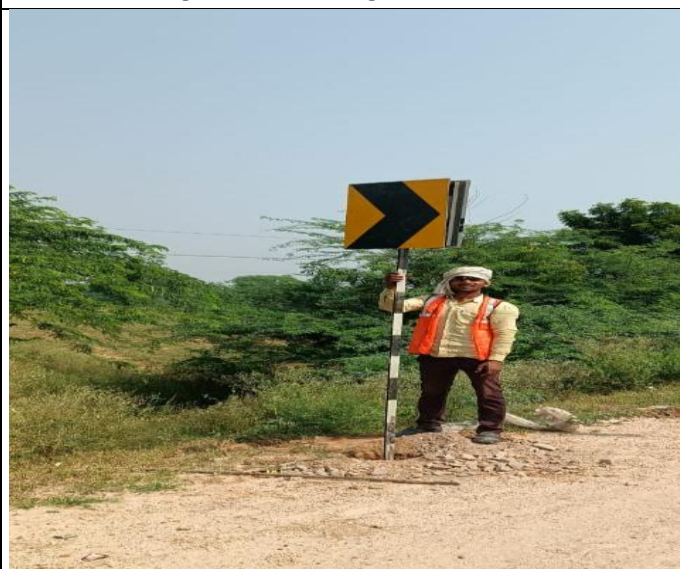
Damaged Sign Board Replacing work is in progress