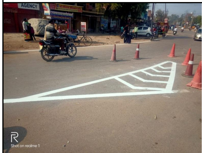
Faded Road Marking repainted at Gursarai Junction