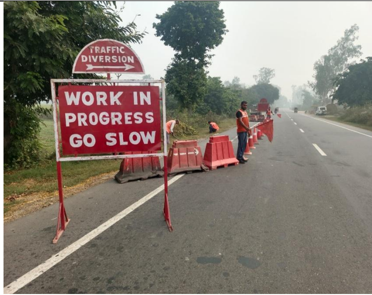
Bushes Cutting Work is in Progress