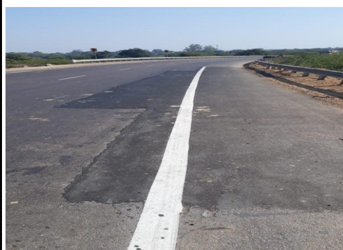
Pot Hole Repaired at Ch. 59+700 (LHS) & Road Marking in progress