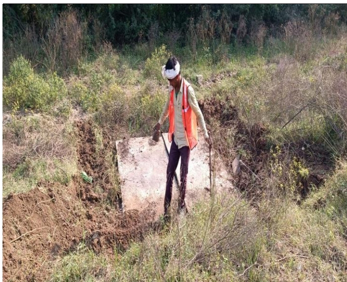
RWH Cleaning is in progress