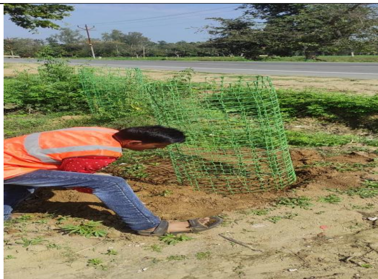
Tree Guard Replaced