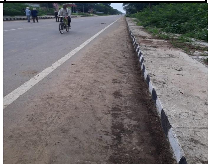
Weep holes Cleaning completed