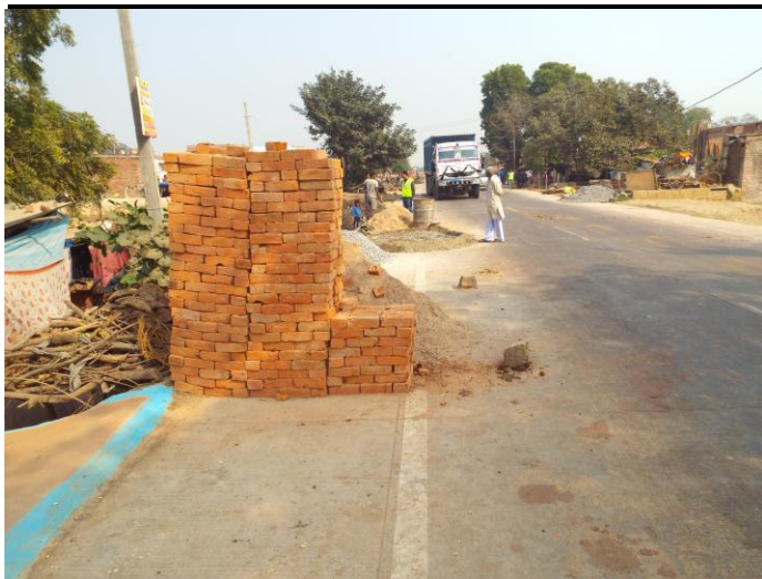
UPG-01 (Hamirpur-Rath) Building Material stored on carriageway