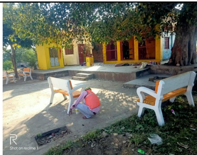
Bench painting at Temple