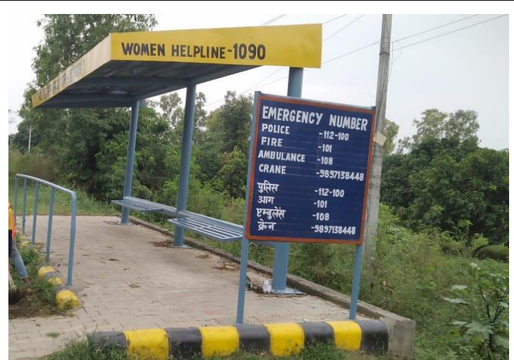
Damaged Emergency Number Board Replaced