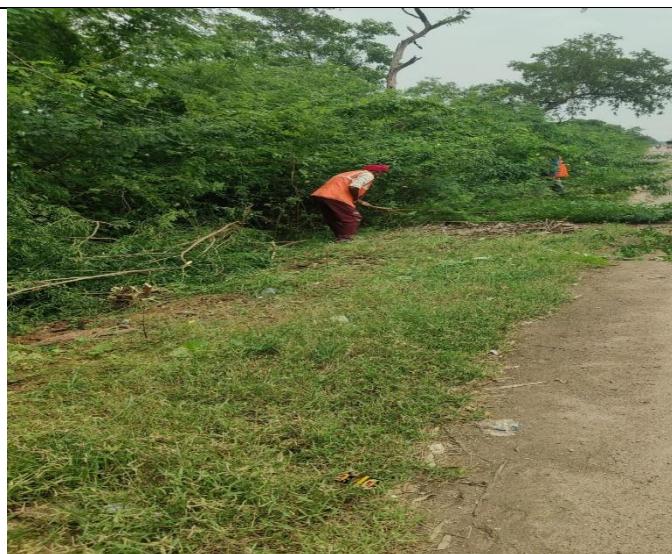
Bushes Cutting Work is in Progress