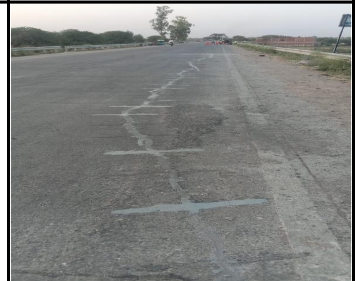
PQC Crack Repaired at Ch.15+000 to Ch.15+100 (RHS)