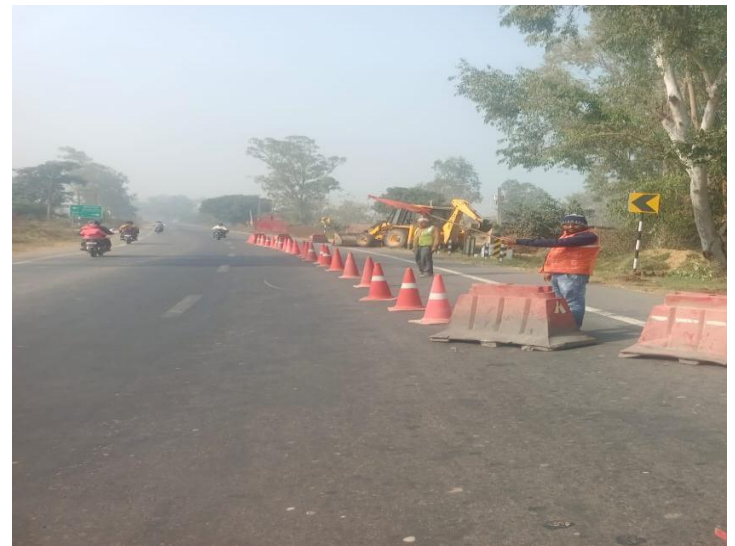
Shoulder Cleaning in progress