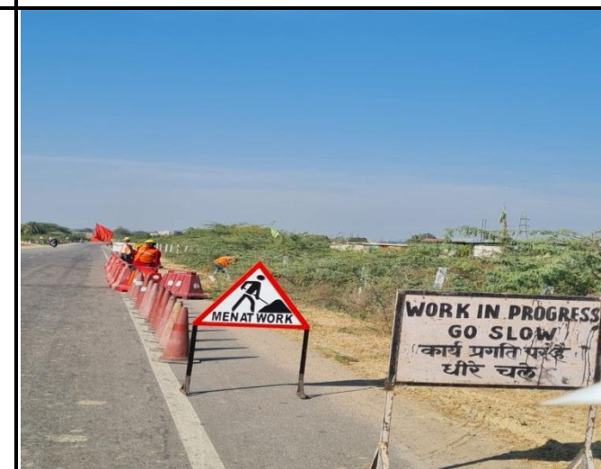
Shoulder Repairing works in progress