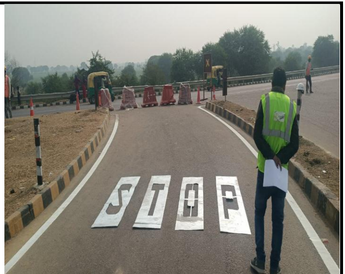
Faded Road Marking is in progress at Ch. 2+065 Major Junction