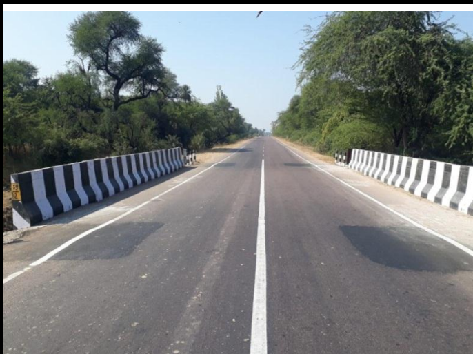
Crash Barrier Repainted & Centre Line Marking in progress