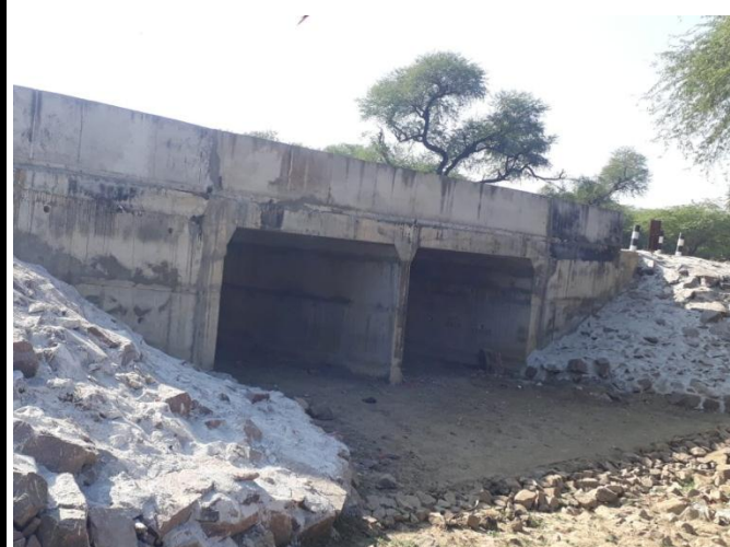
Waterway Cleaned at Bridge Ch. 68+695