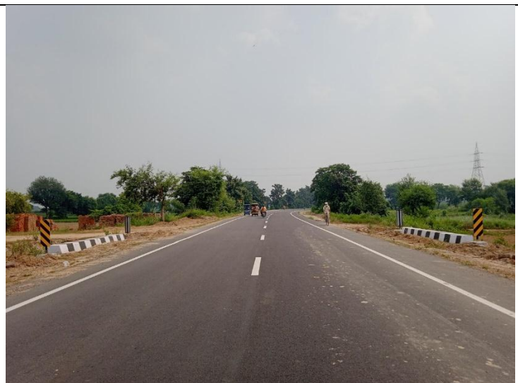
Damaged Hazard Board Replaced