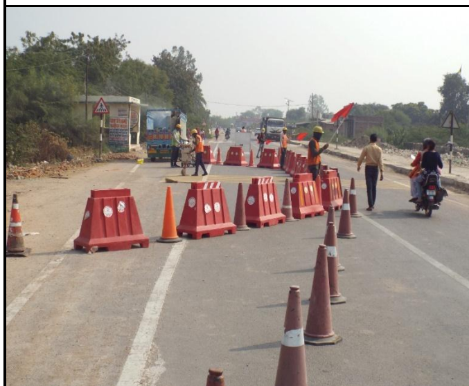
Faded Road Marking is in Progress at Ch. 130+230 with safety arrangements