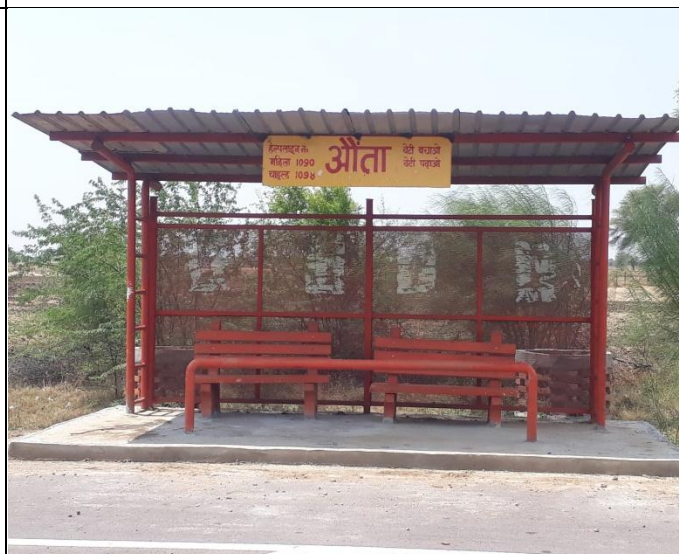
Bus Shelter Cleaned