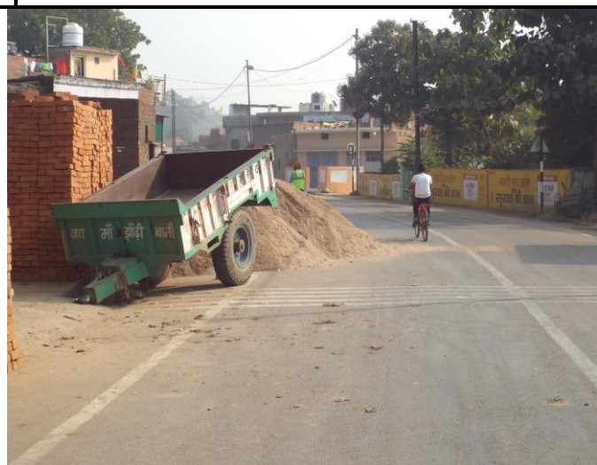
UPG-02 (Garautha-Chirgaon) Building Material stored on carriageway

Note: - Such encroachments are reported to the police on regular basis however the local residents are not following the traffic and road laws. Meetings are to be arranged with community leaders, police, UPPWD, AE and the Contractors for the awareness of the local residents that such practices can cause fatal accidents and damage to their properties. Also cattle kept adjacent to the carriageway could be killed/ seriously injured by the vehicles travelling at high speeds and therefore, the carriageway must be always kept free of such obstructions.