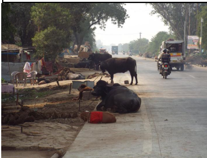
UPG-01 (Hamirpur-Rath) Buffalo tied adjacent to the carriageway