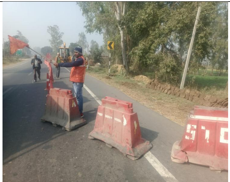
Shoulder Cleaning is in progress