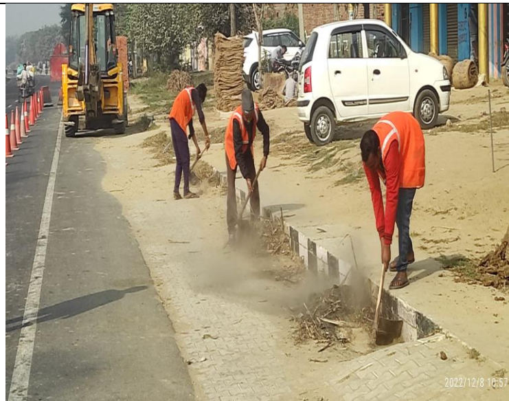
Drain Side Cleaning is in progress