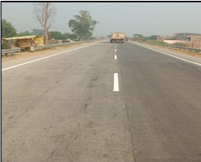
Faded Road Marking Repainted at Ch. 2+900