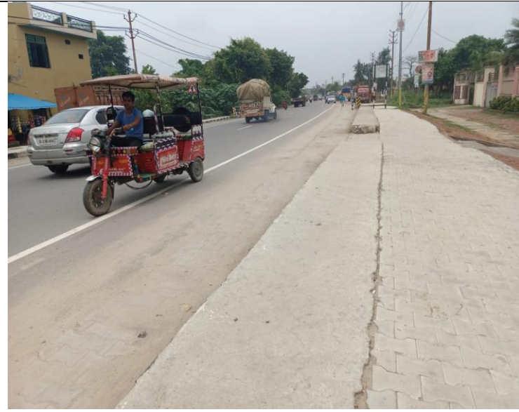
Drain cum Footpath Cleaned