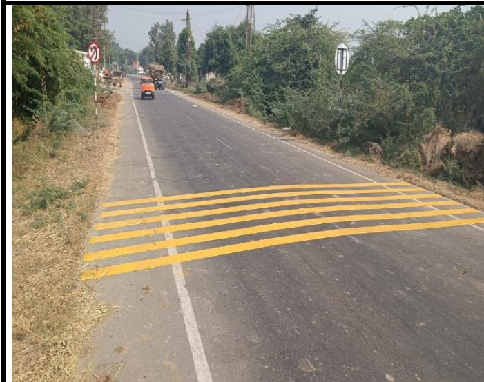
Faded Rumble Strip repainted at Ch. 35+030