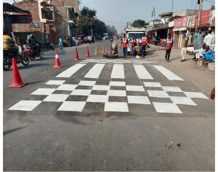
Faded Table Top Road Marking is in progress