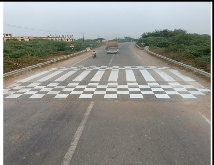
Faded Table Top Repainted at Ch. 129+120