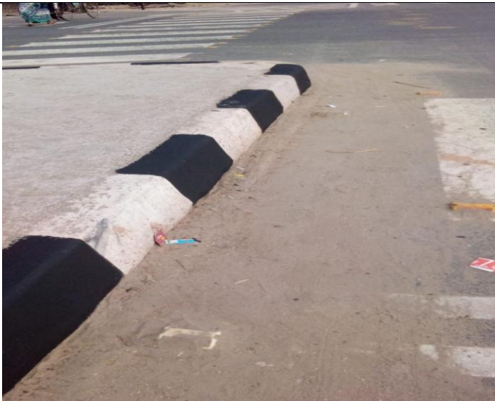
Faded Kerb Repainted