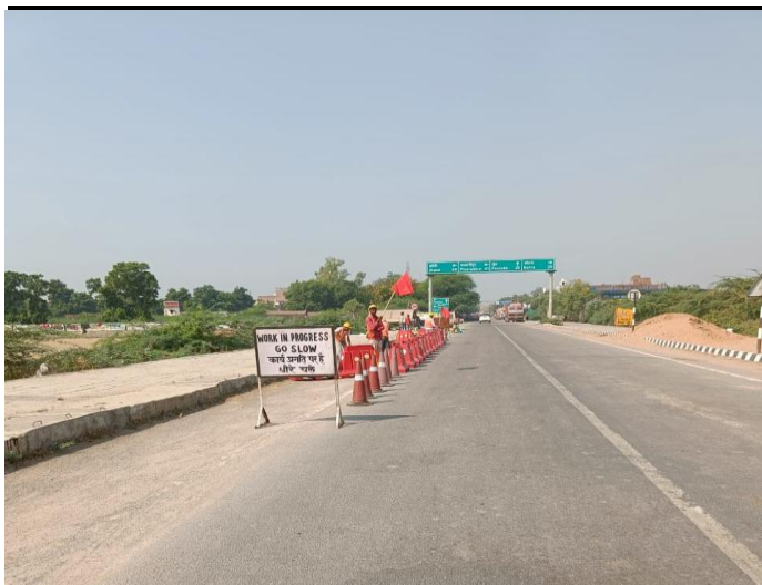
Paved shoulder & Weep holes Cleaning work at Ch. 130+280