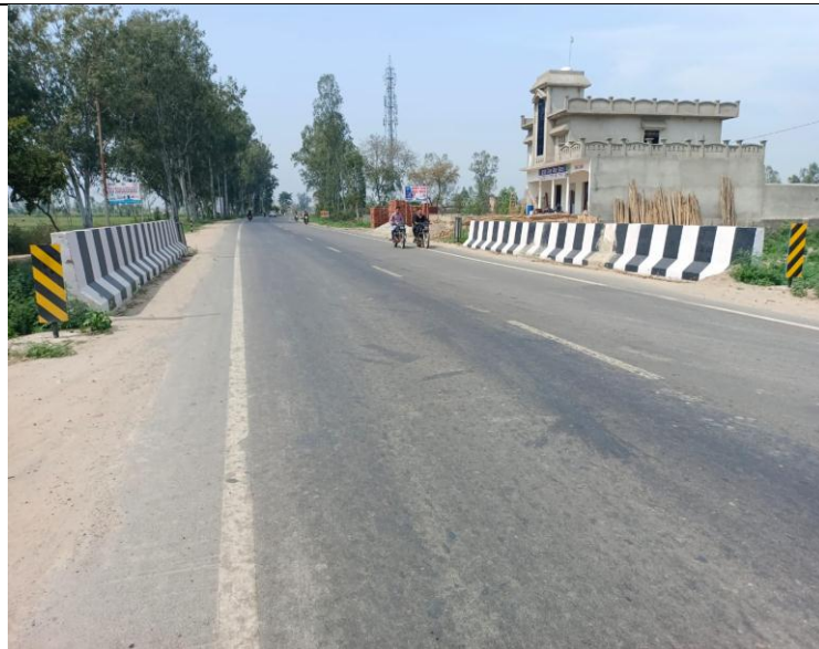
Hazard Board Replaced