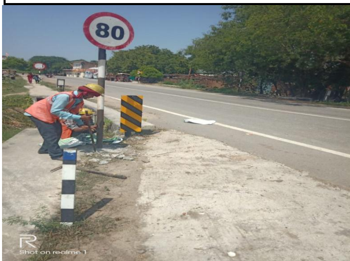
Damaged Sign Board Replacing work is in progress