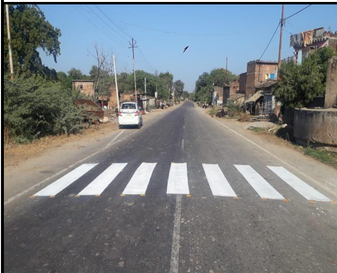
Faded Pedestrian Road Marking Repainted