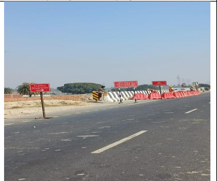
Weep Hole cleaning at Bridge