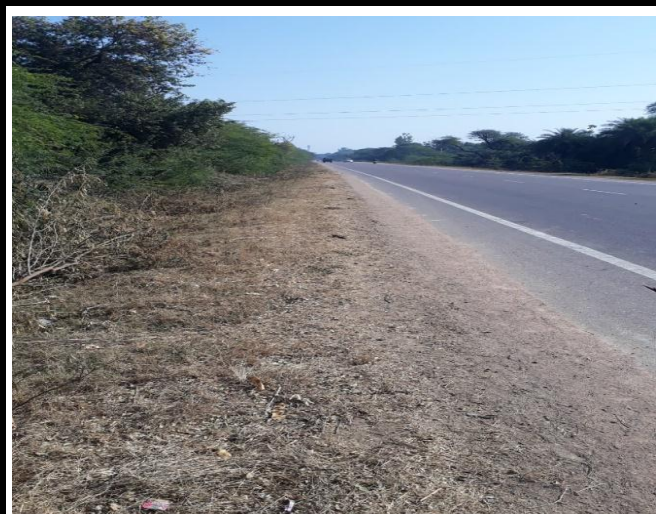
Bush Cleaning Completed at Ch. 70+000 to Ch. 72+000 (BHS)