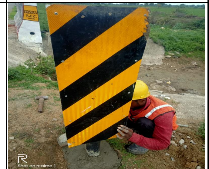
Damaged Hazard Sign Board Replaced