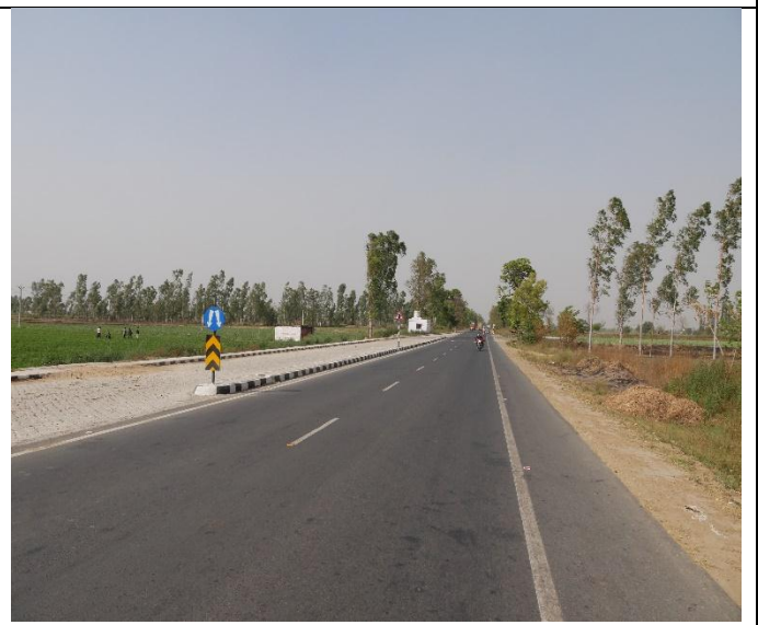
Truck lay bye Cleaned