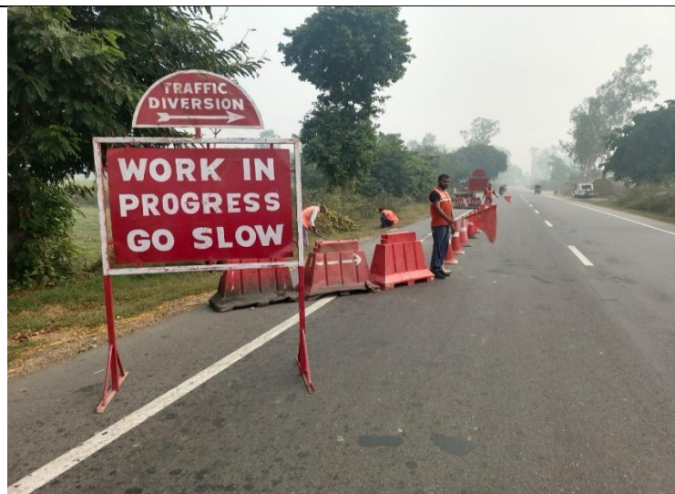
Bushes Cutting Work is in Progress