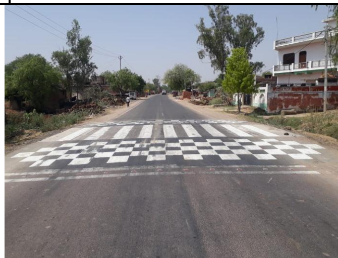
Table Top Repainted