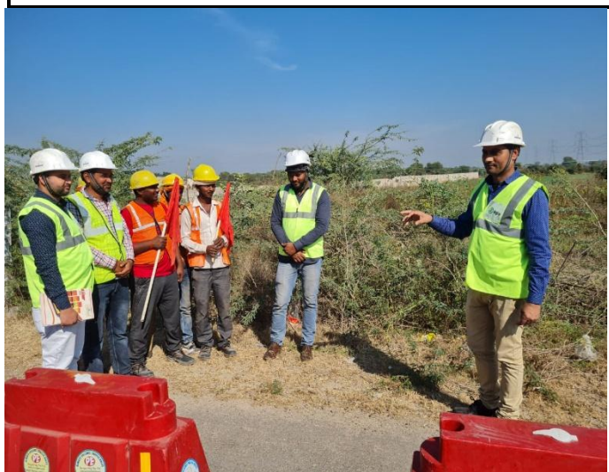
Safety Training for Accident prevention & reporting on live carriageway