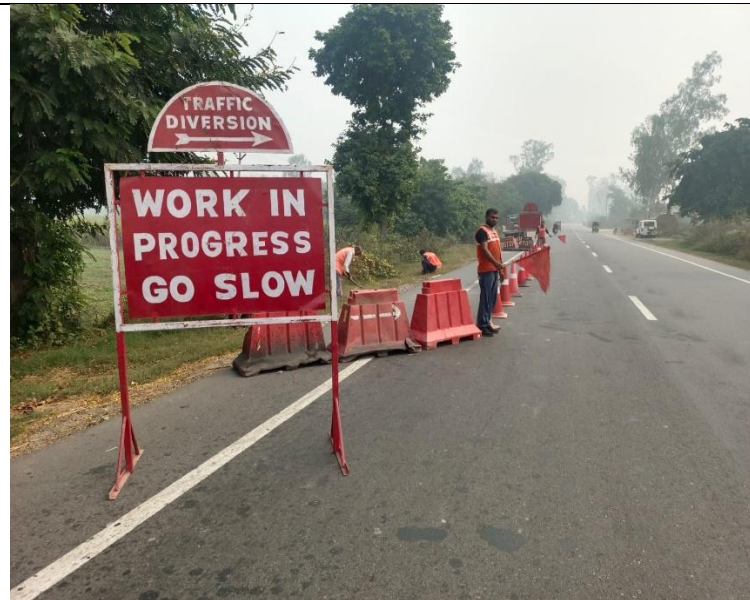
Bush Cutting Work in Progress