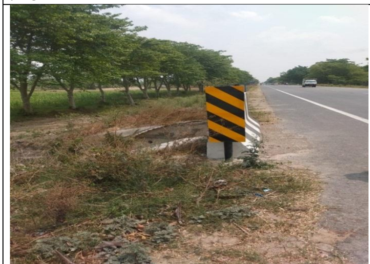
Hazard Marker Board replaced at Ch. 46+150