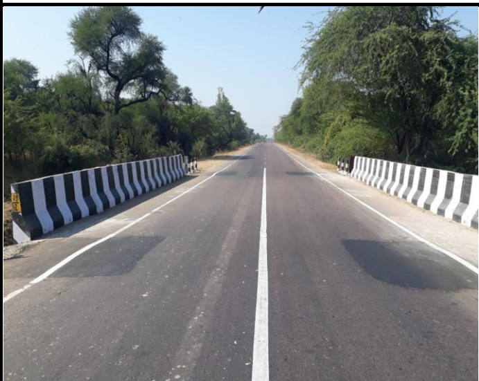
Crash Barrier Repainted & Centre Line Marking in progress