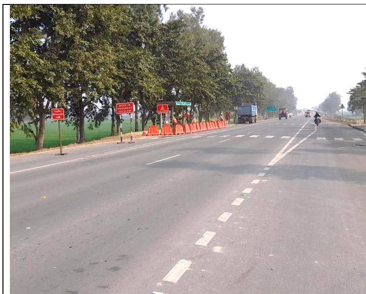
Bus Layby Cleaning at Ch. 44+200 in progress