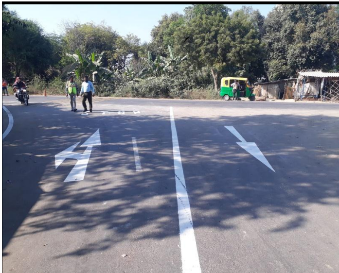
Faded Arrow Marking is Repainted