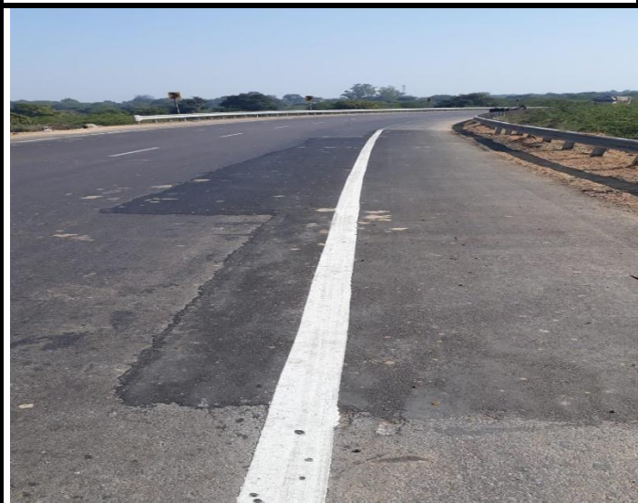
Pot Hole Repaired at Ch. 59+700 (LHS) & Road Marking in progress