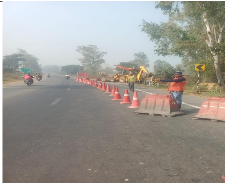
Shoulder Cleaning in progress