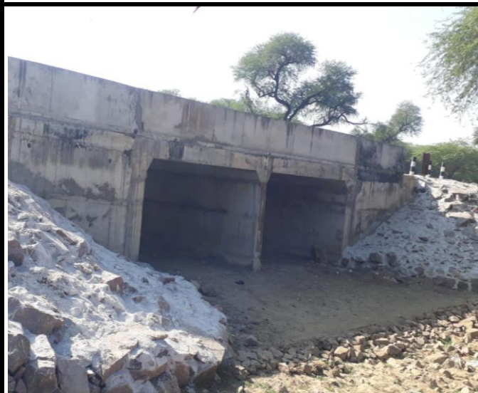
Waterway Cleaned at Bridge Ch. 68+695