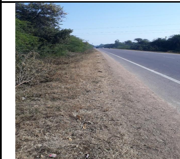
Bush Cleaning Completed at Ch. 70+000 to Ch. 72+000 (BHS)