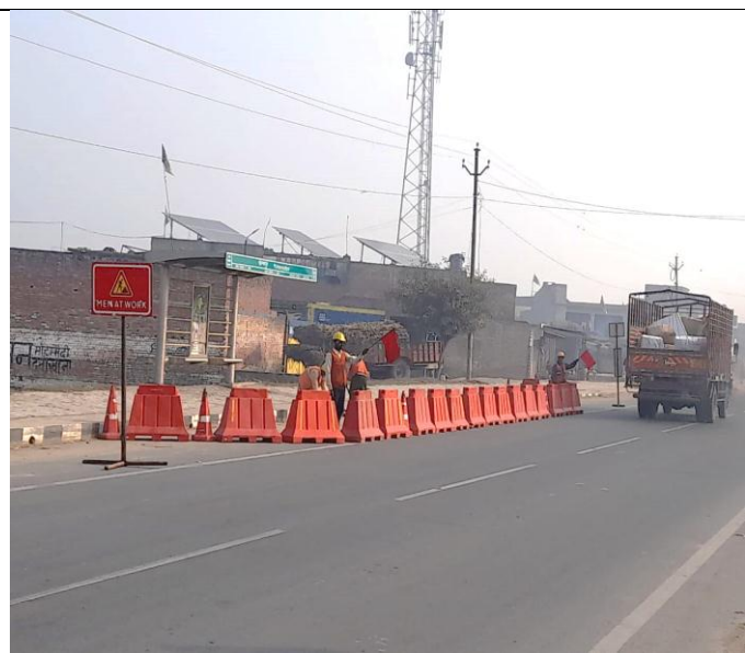
Drain Weep Hole Cleaning at Ch. 47+800 (LHS) in progress