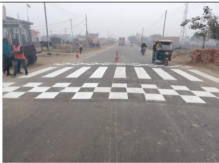
Faded Table Top Road Marking Completed at Ch. 76+080