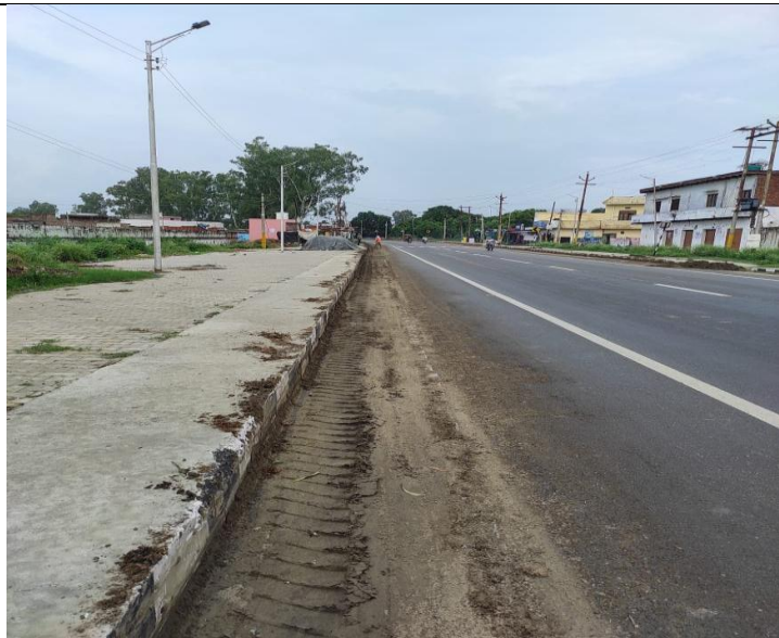
Drain Side Cleaning Completed