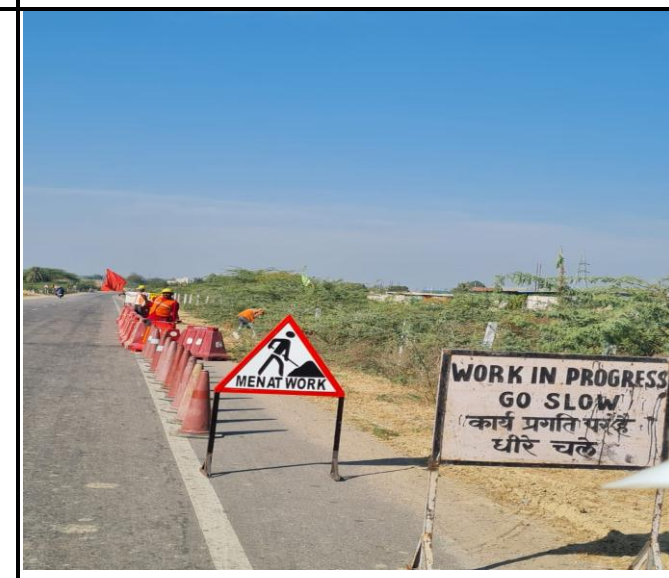
Shoulder Repairing works in progress