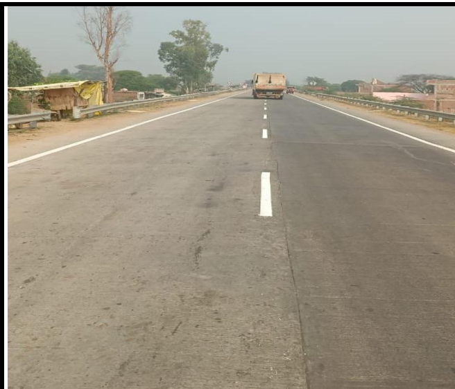
Faded Road Marking is Repainted