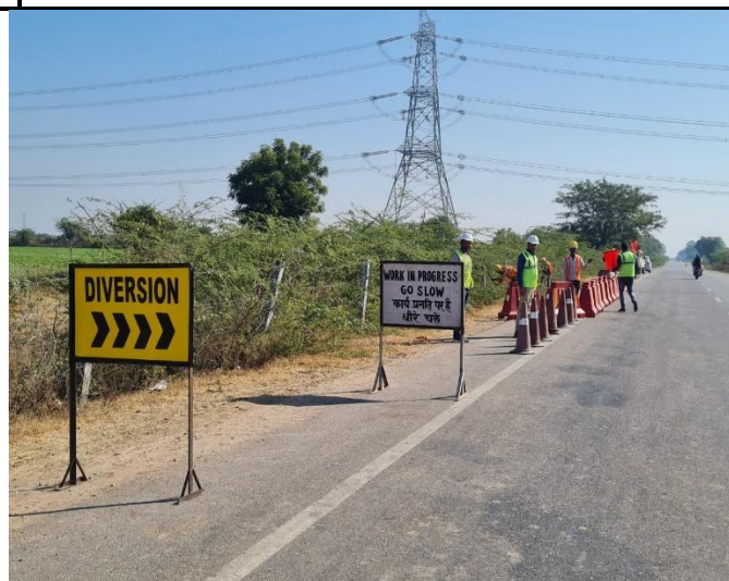
Bush Cleaning in progress