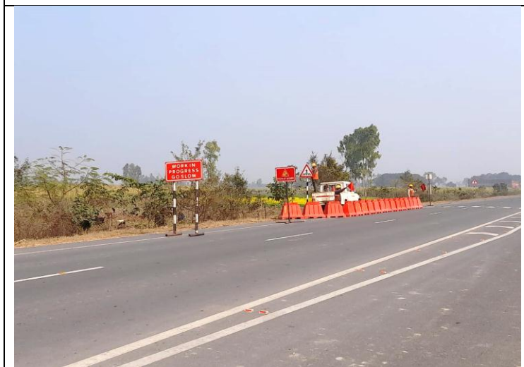
Damaged Pedestrian Crossing Sign Board Refixing in progress at Ch. 41+500