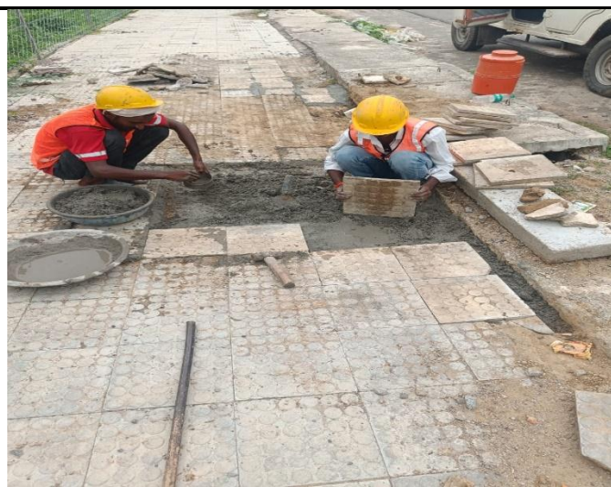
Damaged Tiles replacing in progress