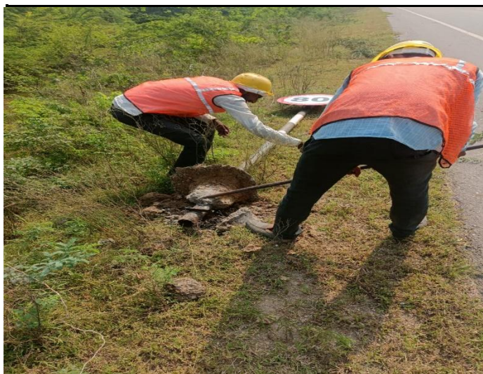
Damaged Speed Sign Board replacing in progress