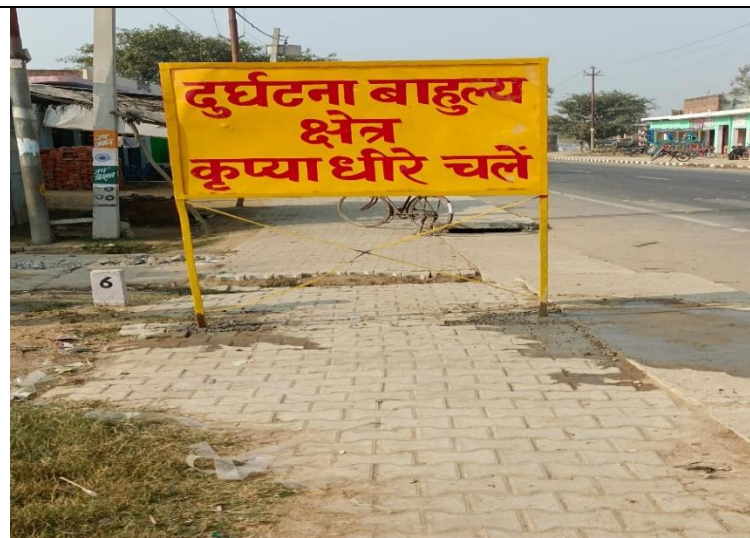
Information Sign Board Refixed