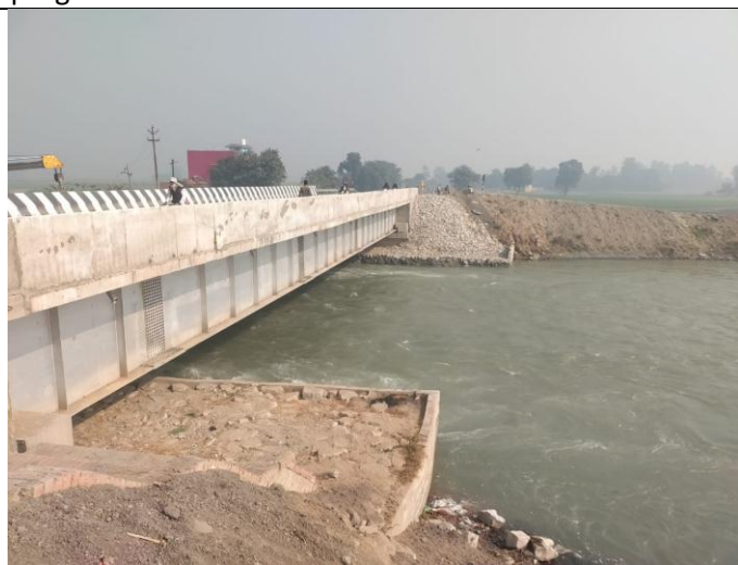
Stone Picking Repaired at Minor Bridge Ch. 46+987