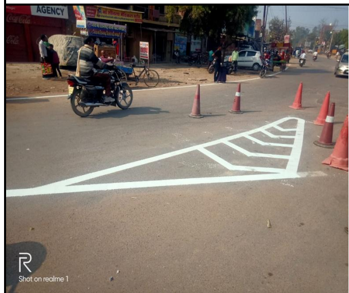
Faded Road Marking repainted at Gursarai Junction