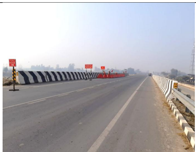
Drainage Spouts Cleaning at Bridge Ch. 47+000 in progress