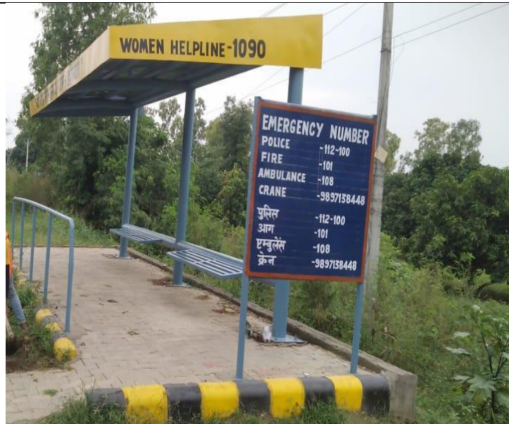
Damaged Emergency Number Board Replaced