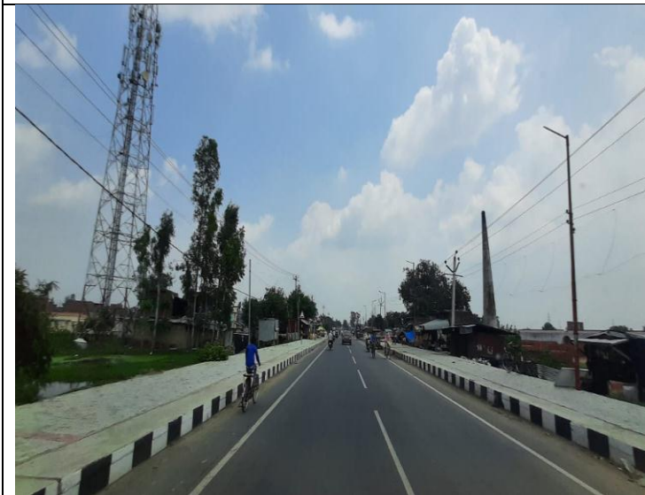
Weep Holes and Paved Shoulder Cleaned