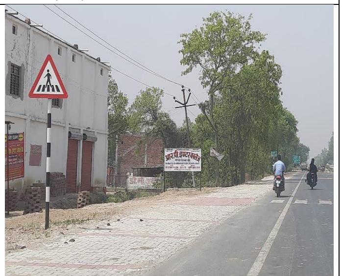
Damaged Sign Board Replaced