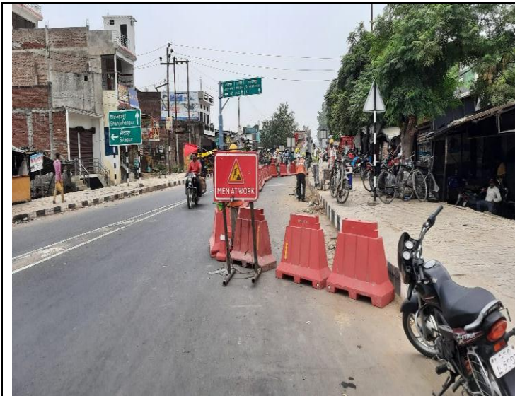
Paved Shoulder Cleaning in Urban Area