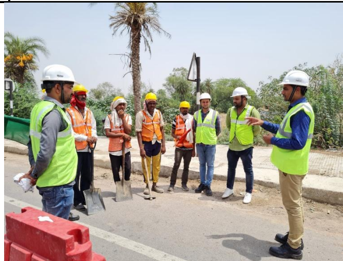
Safety Training for Drainage Cleaning Workers