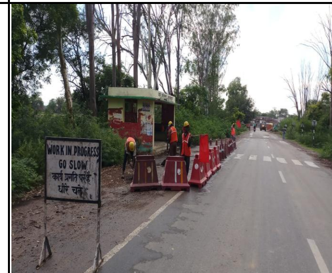
Bus Shelter & Paved Shoulder Cleaning at Ch166+700