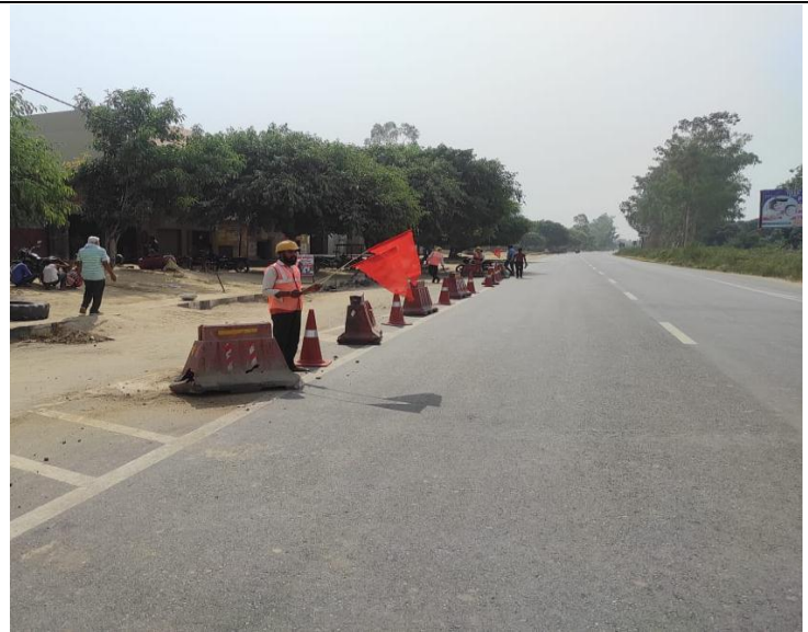
Ch. 103+200 to 103+300 (RHS) – Drain Side Cleaning