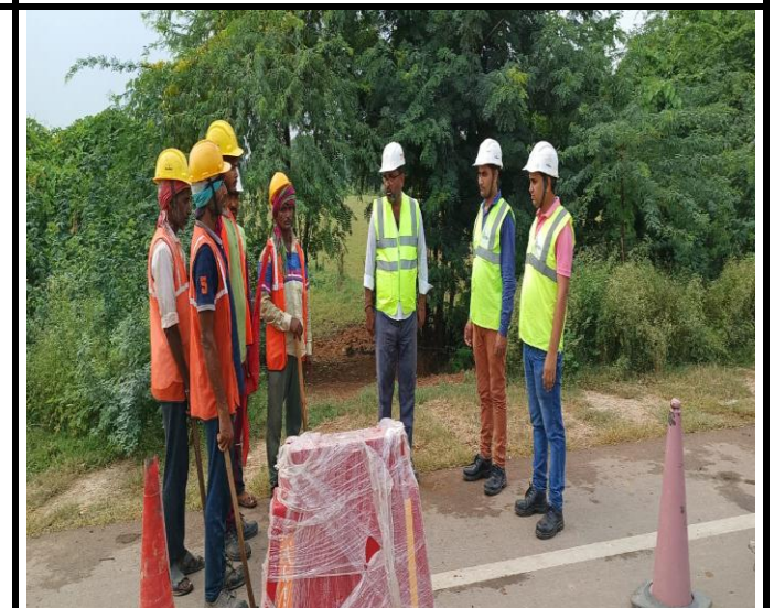
Safety Awareness & Tool Box Talk by Egis Safety Officer