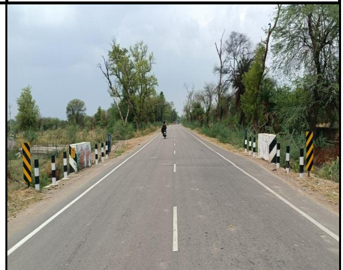
Hazard Board Replaced