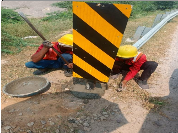
Ch. 161+680 (RHS) - Damaged Hazard Sign Board Replaced