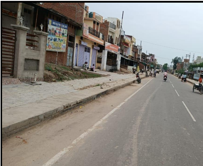
Weep Holes Cleaning Completed