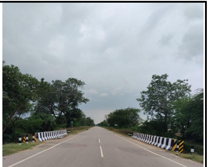
Ch. 71+443 – Concrete Crash Barrier Repainted