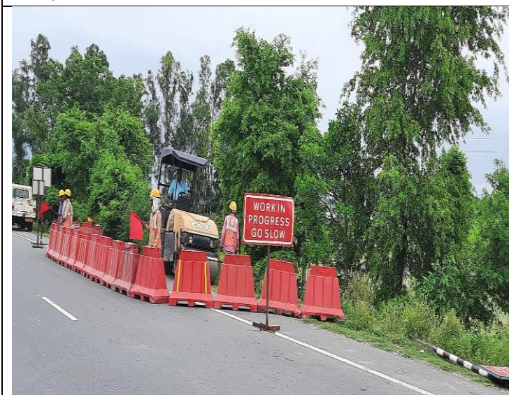
Repairing of Earthen Shoulder after Rain