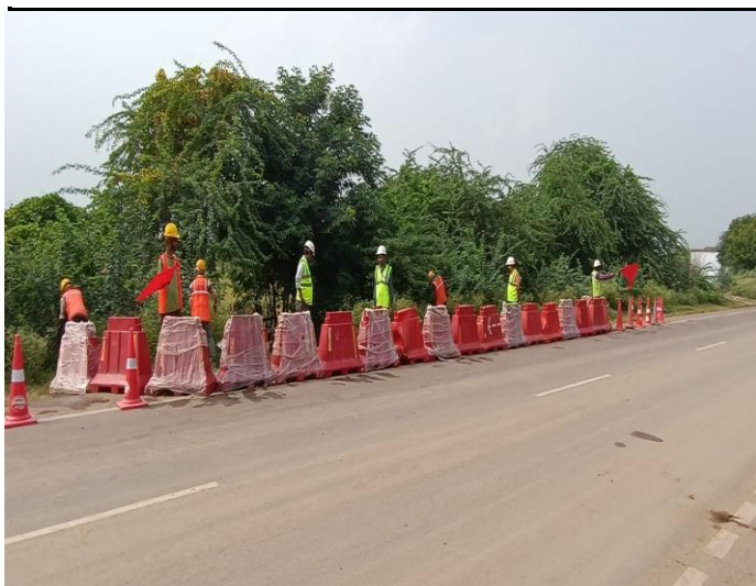
Cutting of Bushes at Ch. 138+300