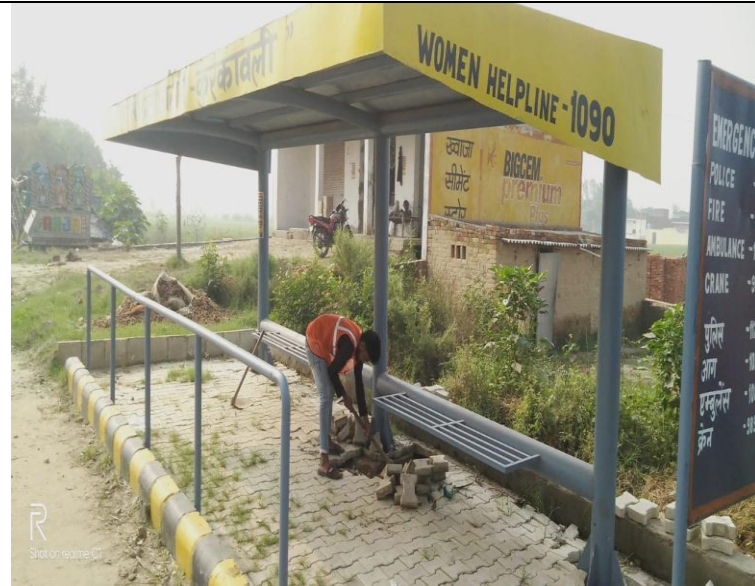
Bus Shelter Paver Block Replacing is in Progress