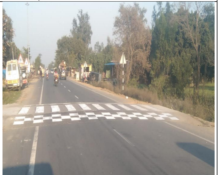
Table Top Repainted