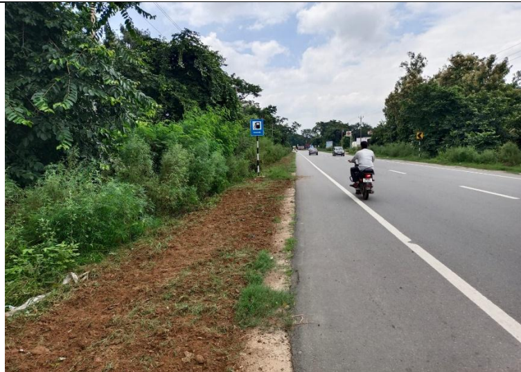
Sign Board Replaced