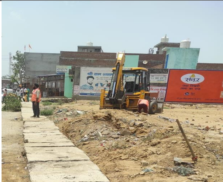
Damaged Cover Slab of RCC Drain Replaced with New Ones