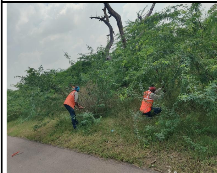
Ch. 69+000 to Ch. 74+500 (BHS) - Bushes Cutting Work is in Progress