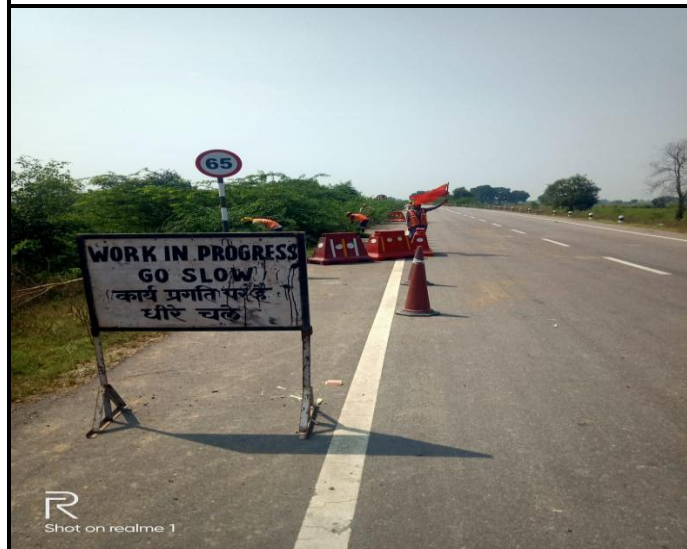
Ch. 125+580 to Ch. 125+750 (LHS) - Bushes Cutting Work is in Progress