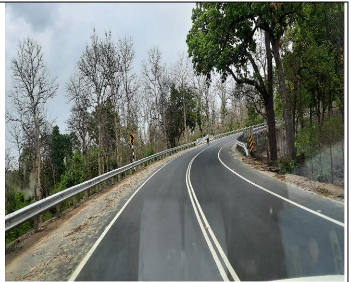
MBCB Replaced at Km. 13+560