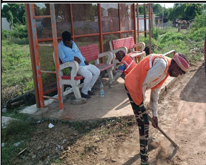
Cleaning of Bus Shelter