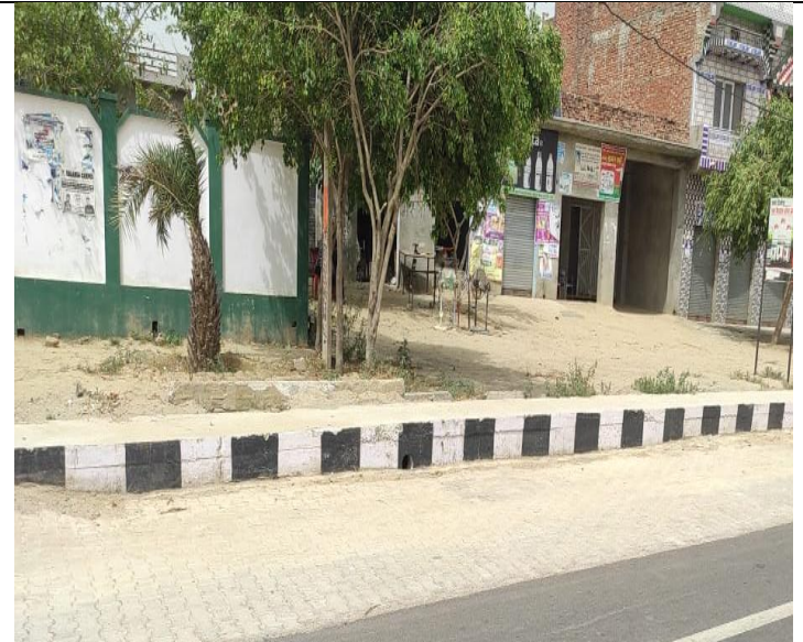
RCC Drain Weep Holes Cleared