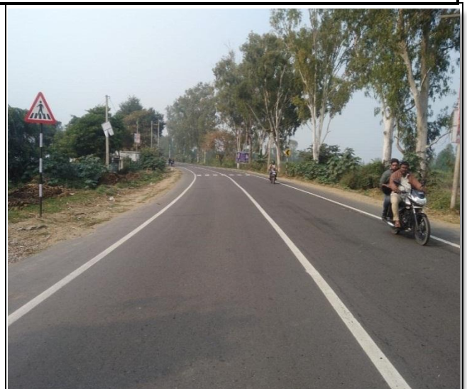
Clearing of the Bushes and Re-Painting of Road Marking of faded Lines