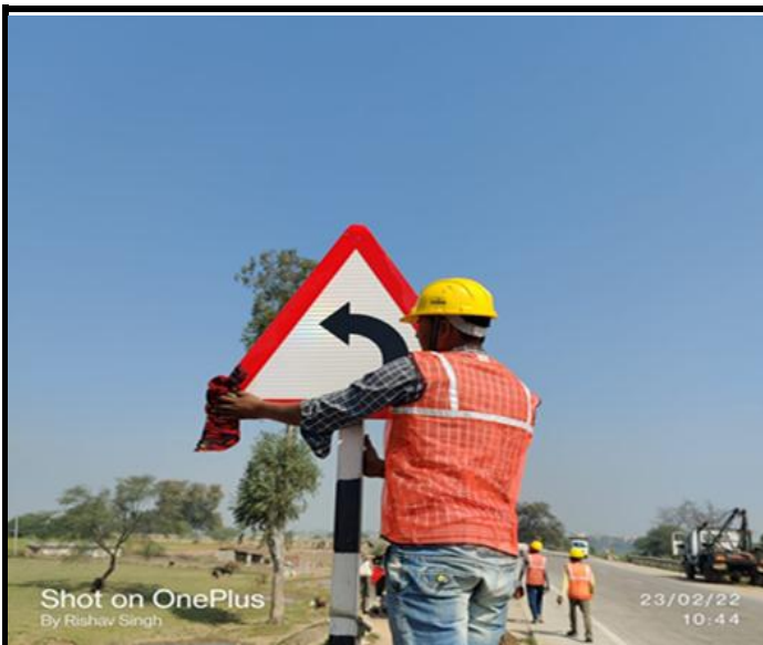
Replacing of Sign Board