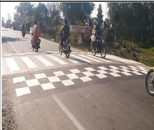
Marking for Table Tops for good visibility