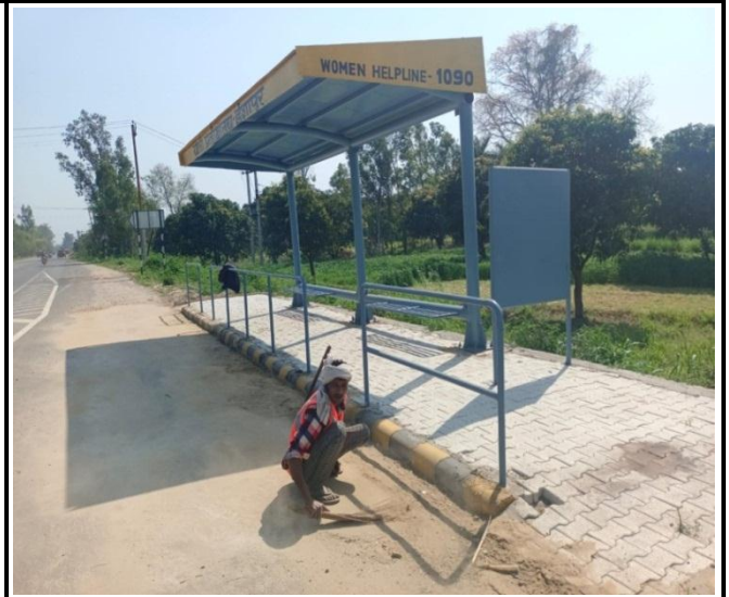
Ch.118+380 (LHS) - Bus Shelter Cleaning with helpline number for women