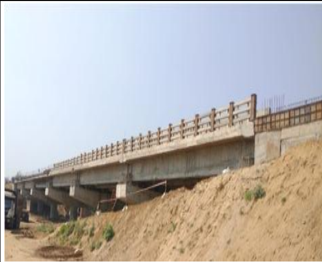
Major Bridge @ Ch.25+608: Slab barrier/ footpath railing Completed during the month of February 2022.