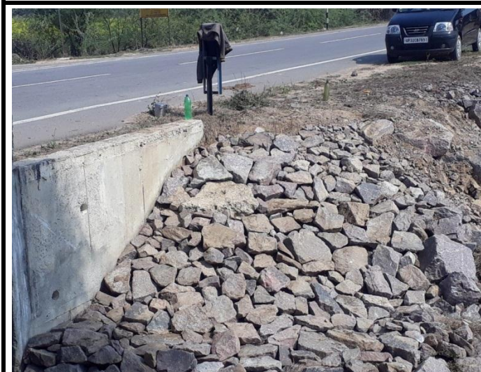
Ch. 71+390 - Stone Pitching Repair is in Progress