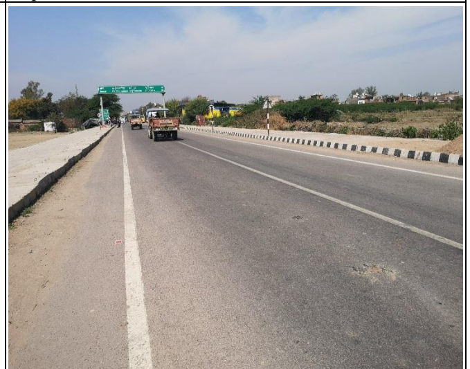
Road Marking and RCC Drain cleaned Kerb painted