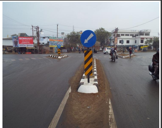
Major Junction at Gola with signs & kerbs completed at start point of the Project