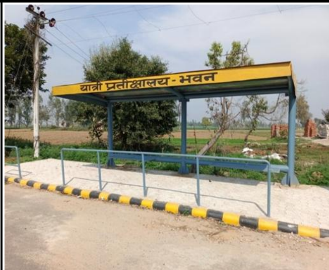
Bus Shelter @ Ch.73+050 RHS