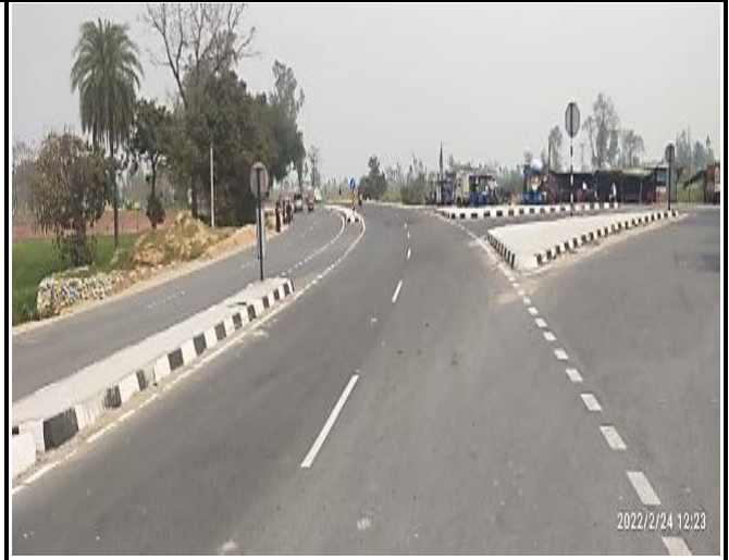
Major Junction at Ch. 24+905 completed with kerb painting and road marking in the month of February 2022.