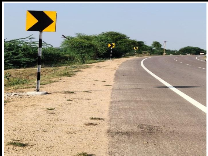
Ch. 27+700 (LHS) – Chevrons