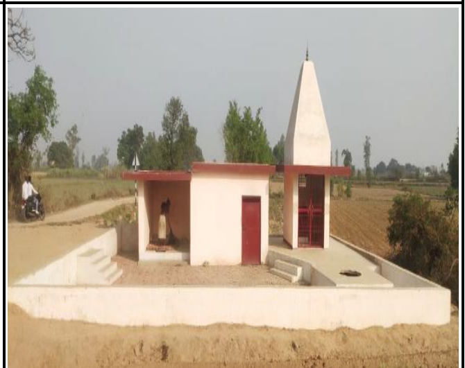
Ch. 12+460 - CPR Structure (Temple Building) Completed