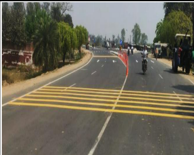
Ch. 24+905 (LHS) – Rumble strips provided as advance warning for approach to Major Junction.