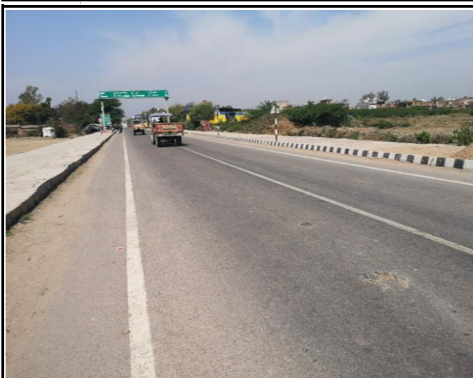
Ch. 129.00 –MBCB and Signage Board Kerb Painting done again.