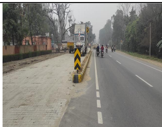
Ch. 136+540 (LHS) – Hazard board replaced at Truck Lay Bye