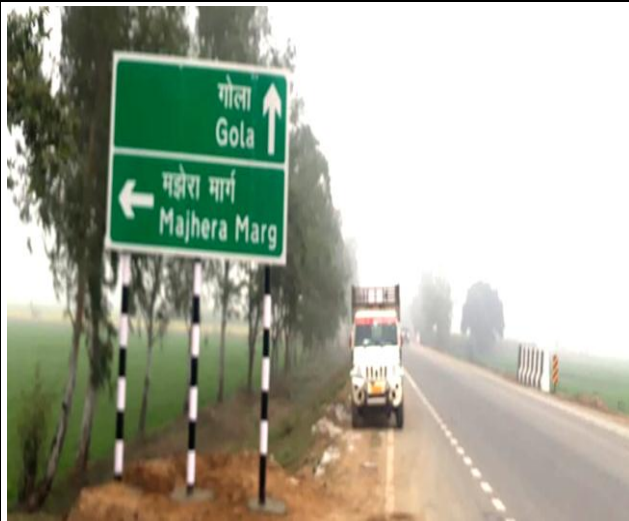
Information Sign Board Installed