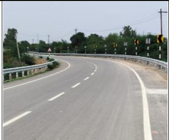
Road Marking done again and damaged Sign Boards replaced