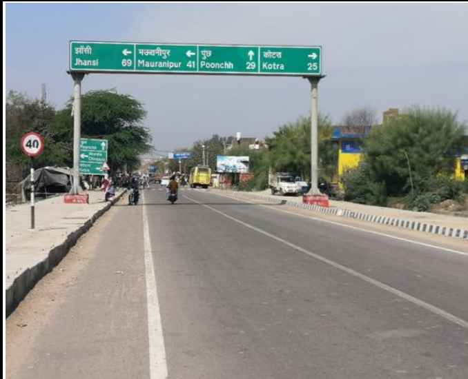
Gantry Board and information Board cleaned and any damaged signs replaced.