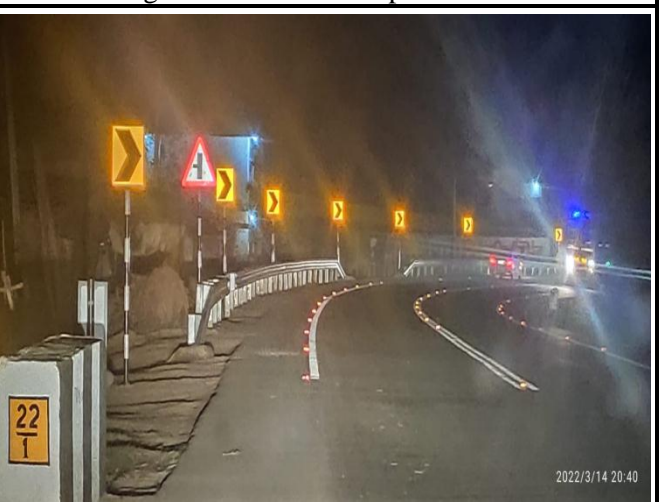
Reflective warning signs for curve and better visibility at Night time.