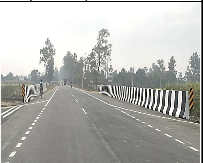
Minor Bridge at Ch. 7+163 completed