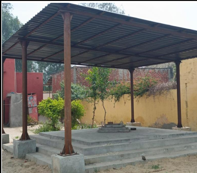
Clean and maintained Hawan Kund (Open Air Praying Place) @ Ch. 103+360 LHS CPR