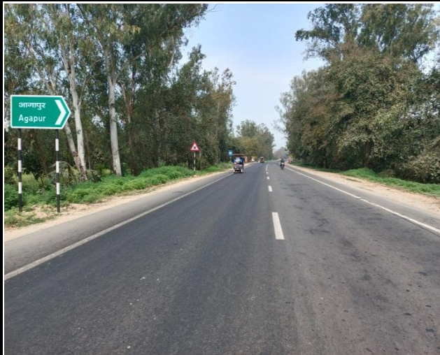
Informatory Sign Board @ Ch. 129+580 LHS and shoulders cleaned.