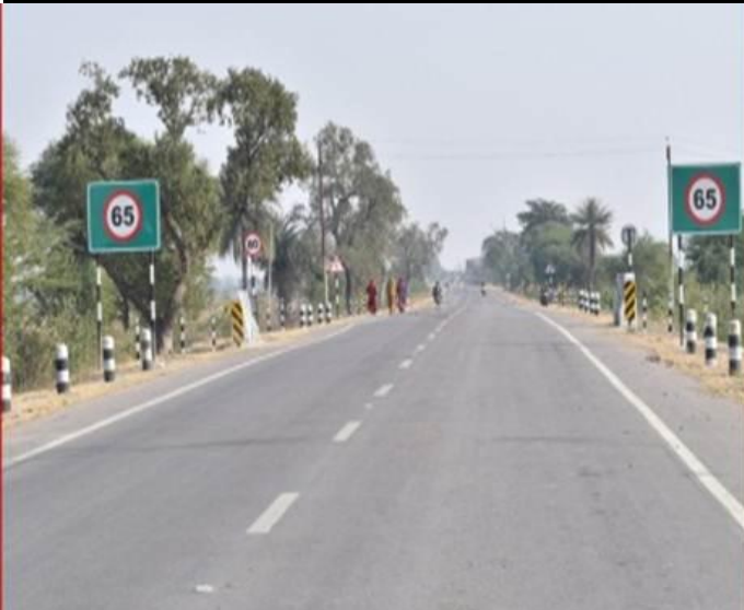
Ch. 122+500 - Speed Limit Sign Boards cleaned and maintained