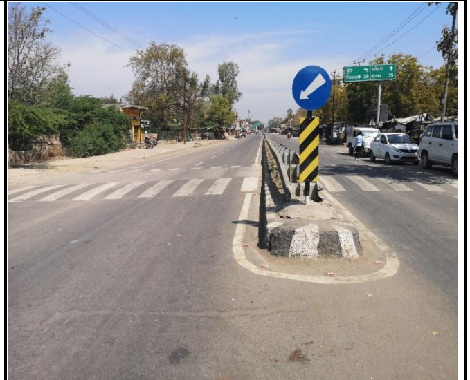
Dual Carriageway at Gursarai hazard sign replaced and Pedestrian Marking done again.