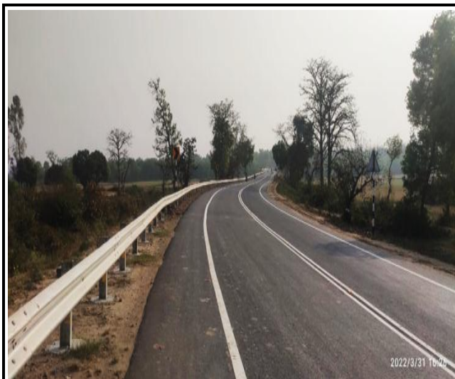
Ch. 12+200 - W-Beam Crash Barrier Provided at High Embankment Locations.