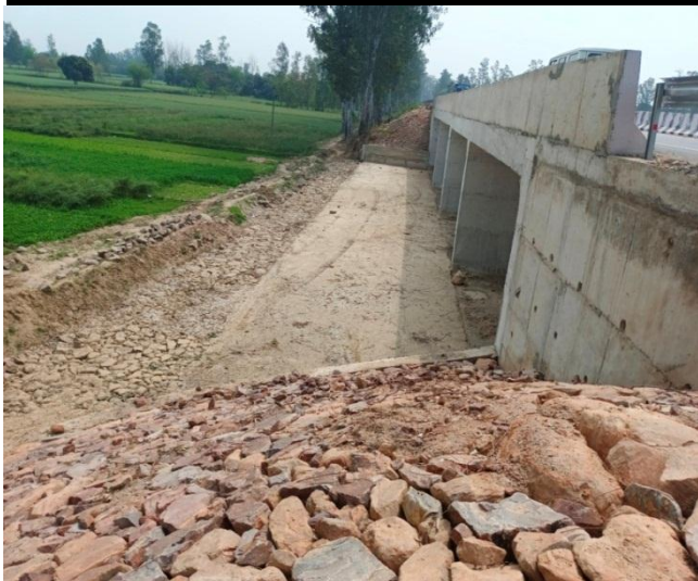
Boulder Pitching and apron cleaned and repaired MNB @ Ch. 120+468 LHS