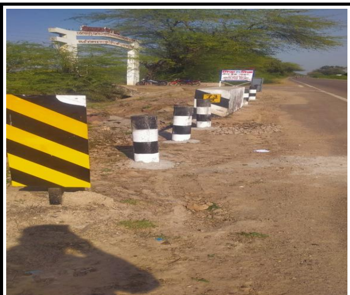
Km. 72+627 - Bollard