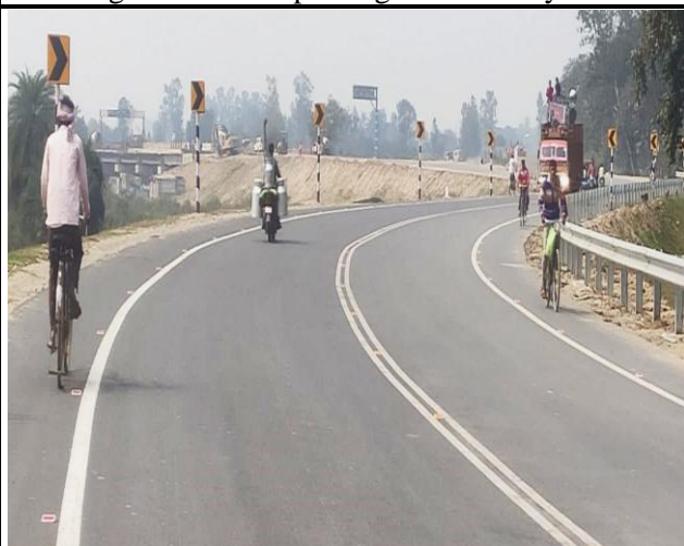
Chevron Board, MBCB, Road Marking & Road Studs Work completed @ Ch. 25+100