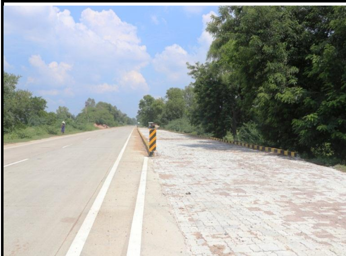
Ch. 18+700 – Truck Lay Bye