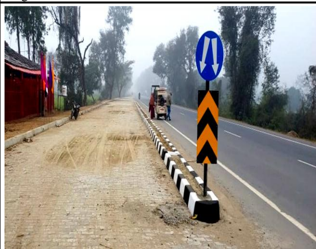
Kerb Laying & Paver Block Fixing Completed at Truck Lay Bye Location