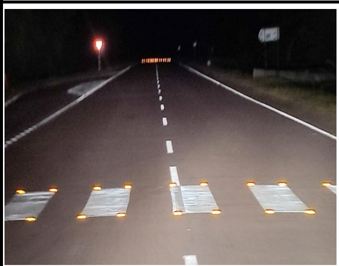
Night View of Road with road studs replaced.