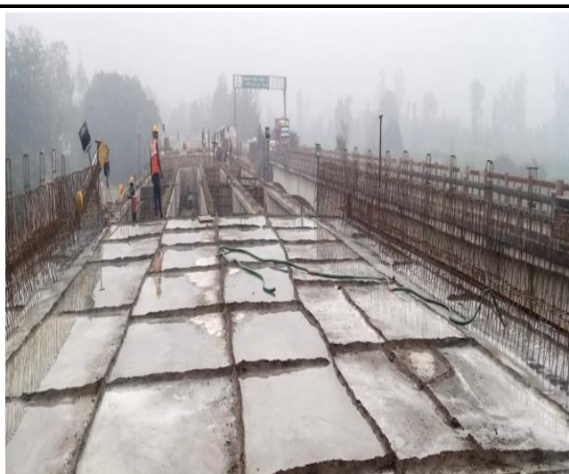
Major Bridge at Ch. 25+608 – Deck Slab A1-P1, P1-P2 & A2-P5 Completed in January 2022.