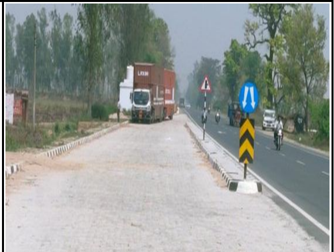
Ch. 23+090 (RHS) - Truck Lay by Work Completed with washroom block.