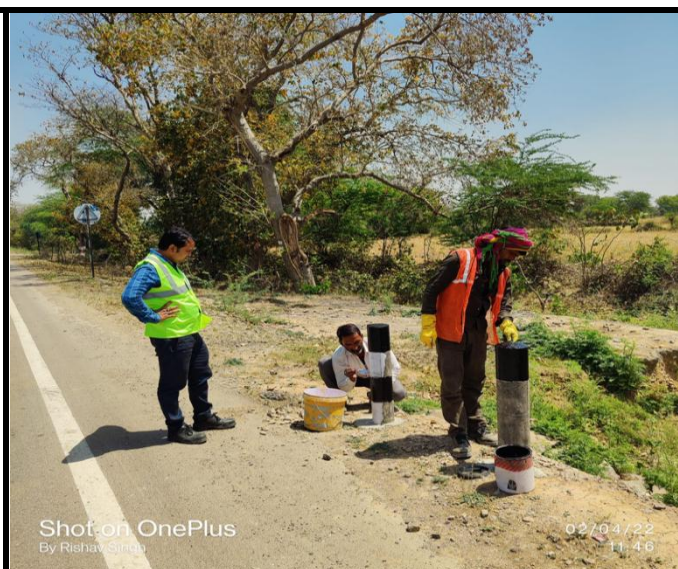
Bollards Fixing at Culverts for Safety