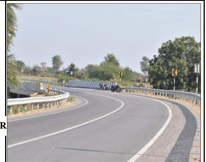
Ch 125+871-MBCB with Safety Sign Boards.