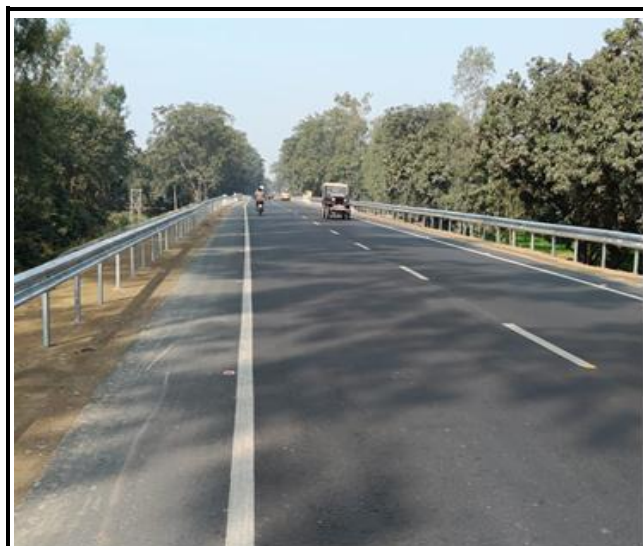
Ch. 129+860 to Ch. 130+015 (BS) – Damage Part of MBCB replaced