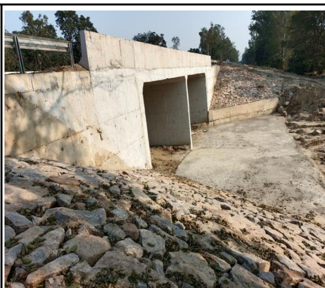
MNB at Ch. 130+021 – Stone Pitching repaired