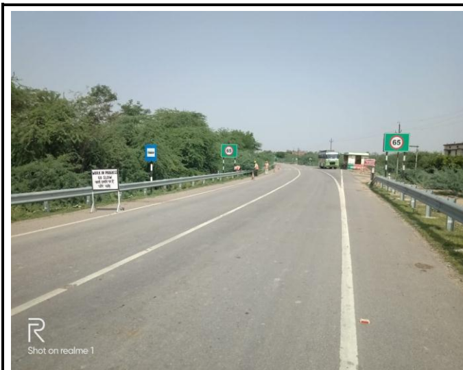
Ch. 129.00 –MBCB and Signage Board