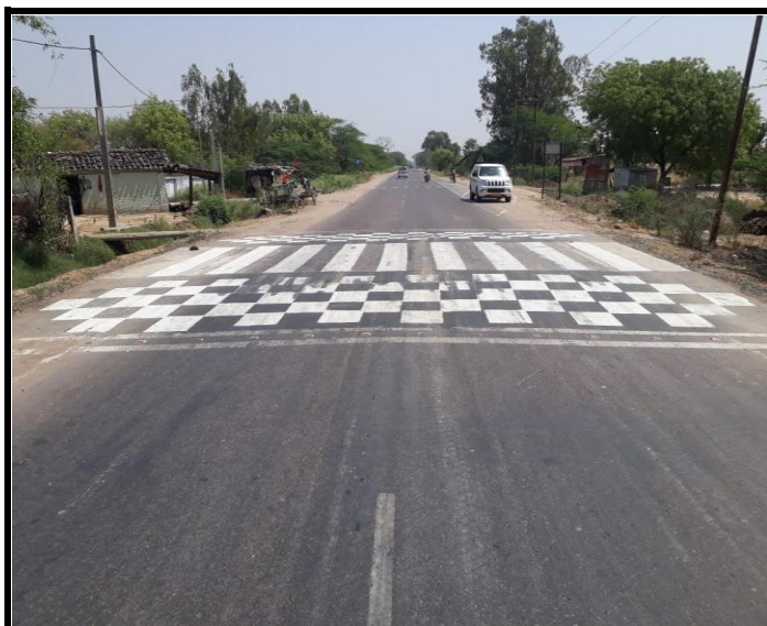
Table top Road Marking done again