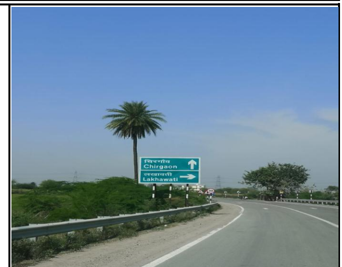
Road Marking and Sign Board repainted and repaired.