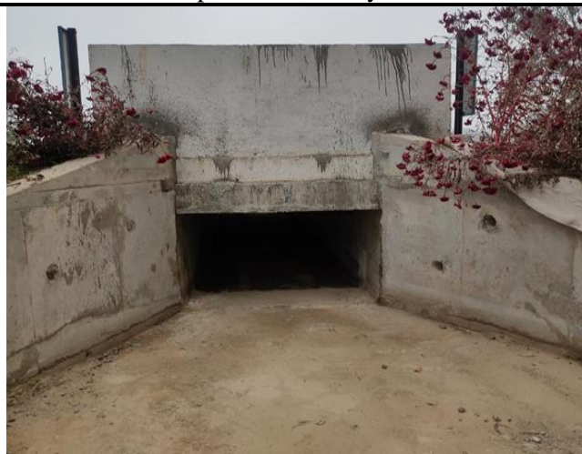
Ch.46+075- Slab Culvert Completed