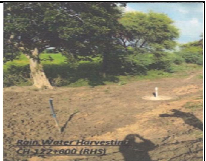
Cleaning of Rain Water Harvesting