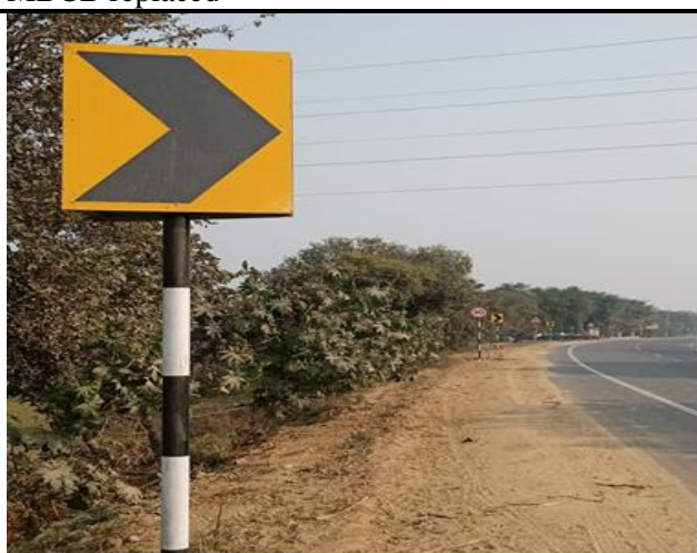
Ch 58+800 – Damaged Chevron Sign Boards at the Curve replaced.