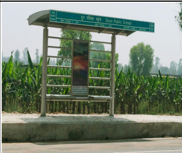
Ch. 19+010 (RHS) - Bus Shelter with emergency numbers Installation Work Completed