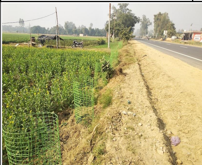
From Ch.98+000 to Ch. 107+000 - Maintenance of Tree Plantation with Guard