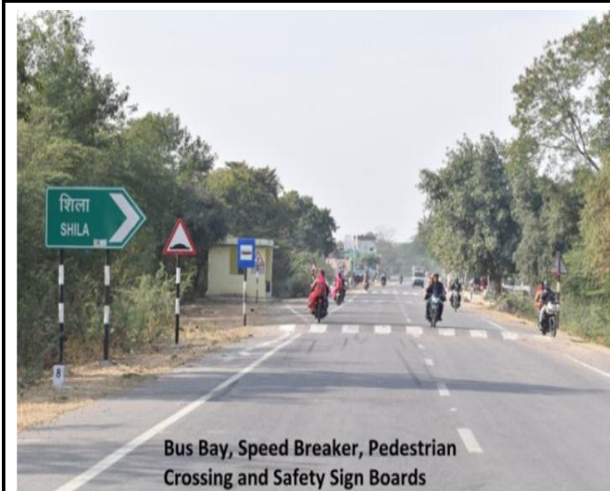
Bus Bay, Speed Breaker, Pedestrian Crossing and Safety Sign Boards