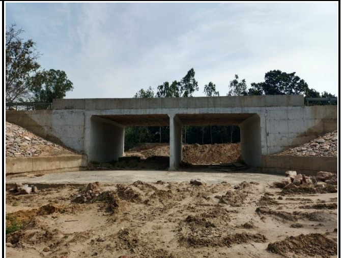
Inlet and Outlet cleaned @ box/bridge Ch. 130+021 RHS