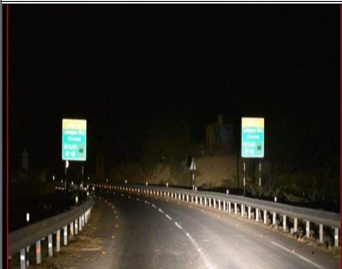
Safety Sign Boards & W Beam Barrier maintained