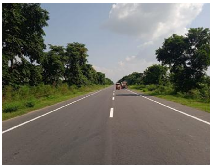
UPG-04: Ch. 74+300 - Road Marking is in Progress