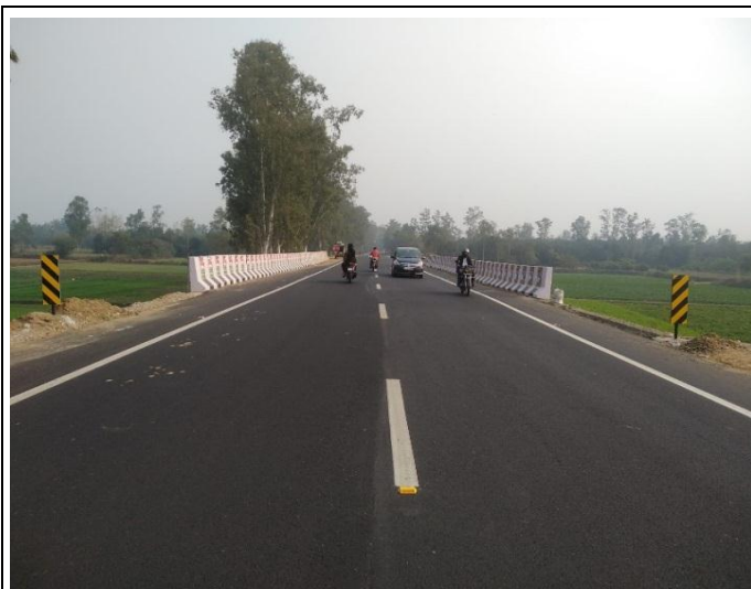
UPG-04: Ch. 120+468 – Minor Bridge