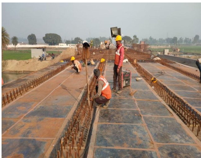
UPG-03: MNB at Ch. 43+682 – Slab Work in Progress