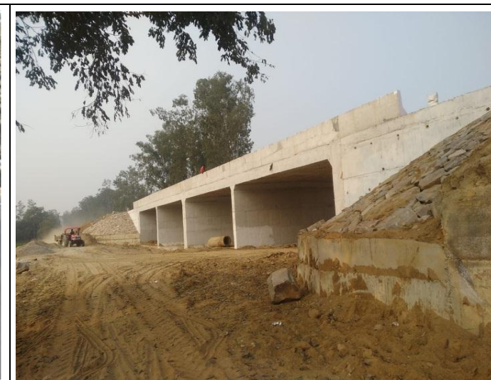
UPG-04: MNB @ 120+468 (RHS) - Protection Work is in Progress