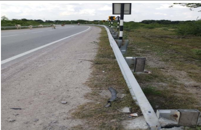
UPG-02: Ch. 159+300 (RHS) - MBCB Re-Installed