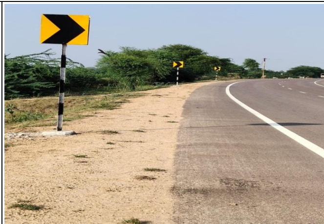
UPG-01: Ch. 27+700 (LHS) – Chevrons Installed