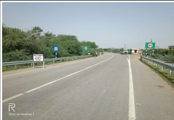
UPG-02: Ch. 129.00 –MBCB and Signage Board