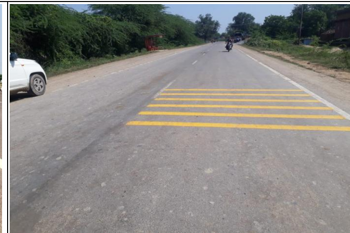
UPG-01: Rumble Stripes laid before Table Top