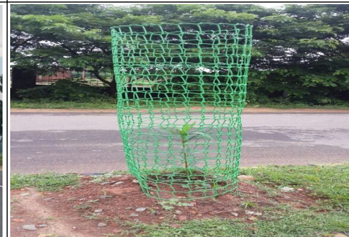
UPG-04: Tree Guard