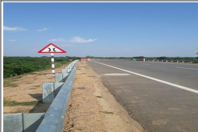
UPG-01: Ch. 59+200 (BS) – Sign Board Installed