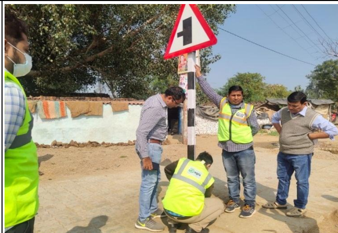
UPG-01: IQA Visit and checking of Quality of Signs