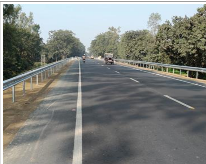
UPG-04: Ch. 129+860 to Ch. 130+015 (BS) - MBCB Installation