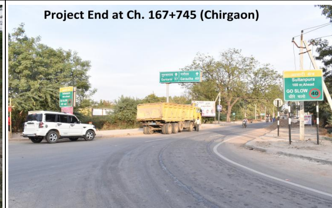
UPG-02: Project End at Ch. 167+745 (Chirgaon)