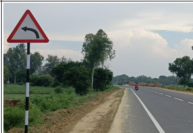
UPG-04: Ch. 60+100 - Cautionary/ Warning Sign Board Installed