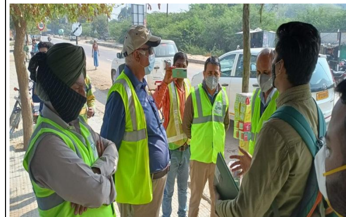
UPG-02: RUSS Survey Conducted