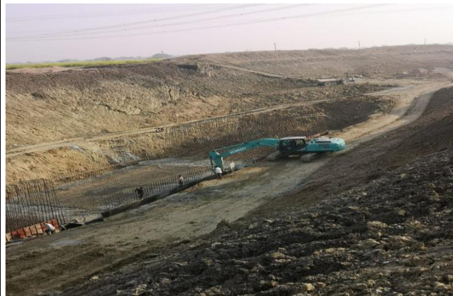
UPG-02: Ch. 139+600 on MCW - Completed Road Excavated for Irrigation Canal BOX Culvert Work