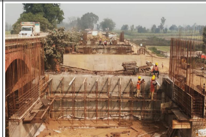
UPG-03: MNB 12+758 Work in Progress