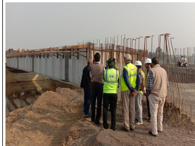
UPG-03: Ch. 43+685 - Site Inspection Carried out by Project Director