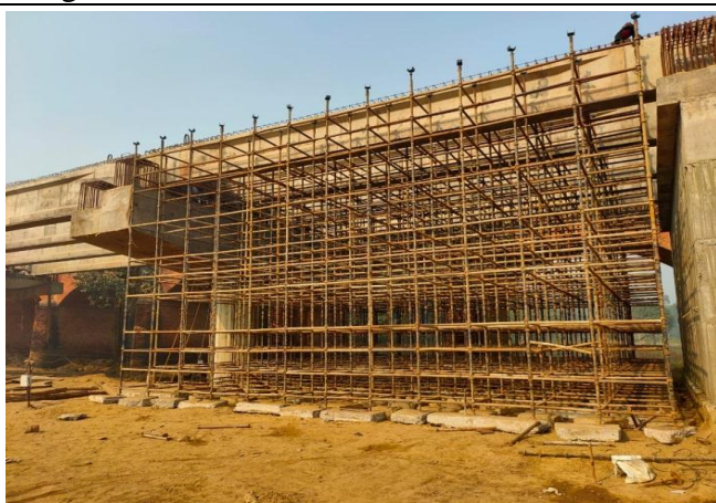
UPG-03: MNB at Ch. 12+759 – Scaffolding for Slab