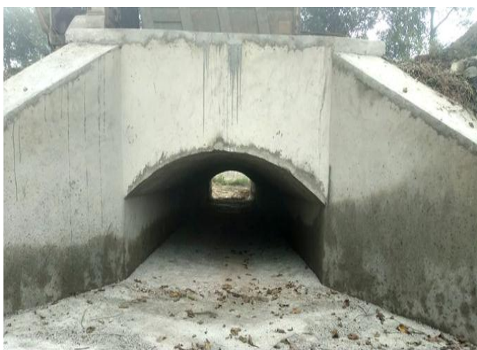
UPG-03: Ch. 4+937 - Arch Culvert