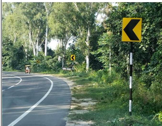
UPG-04: Ch. 129+200 - Chevron Boards Installed.