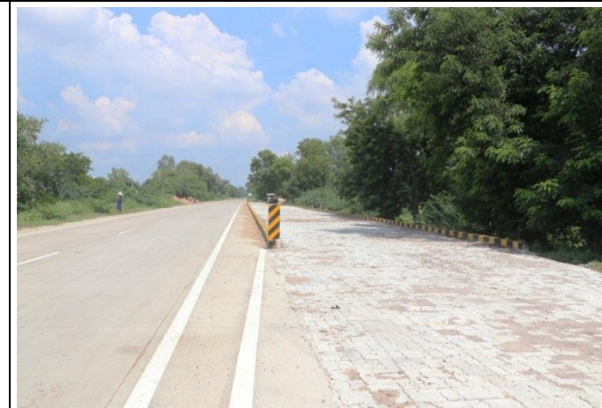
UPG-01: Ch. 18+700 – Truck Lay Bye