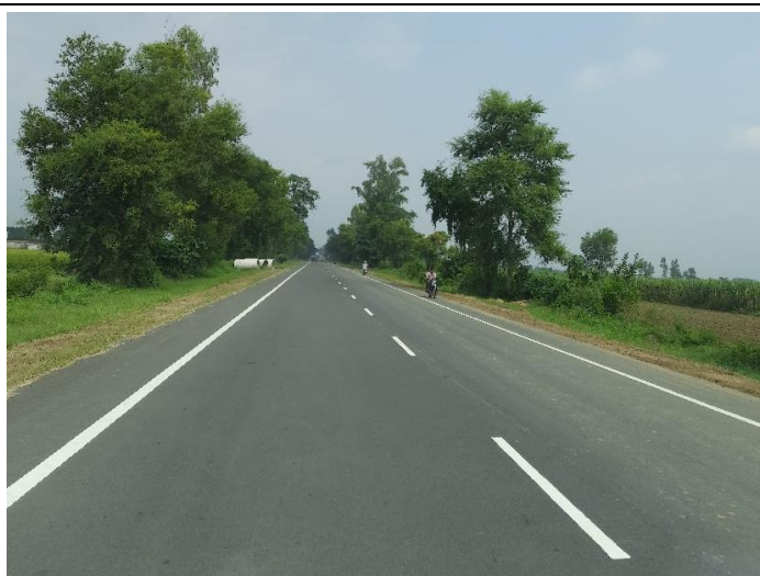
UPG-03: Ch. 22+500 - Road Marking Completed