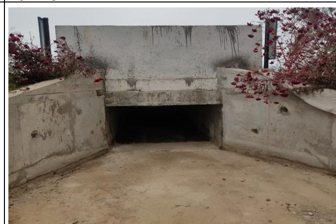
UPG-03: Ch 46+075-Slab Culvert