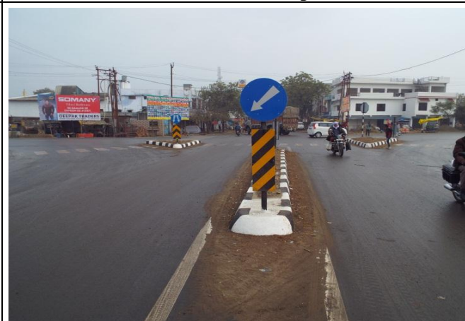
UPG-03: Junction Photograph