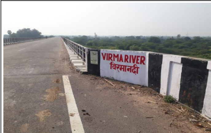
UPG-01: Painted Name of the River on Major Bridge