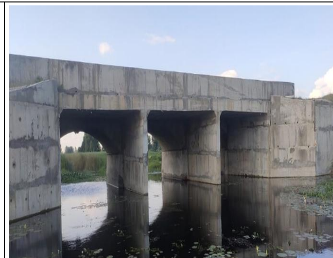
UPG-03: Ch. 13+000 - Chevron Board Provided at Curve Location