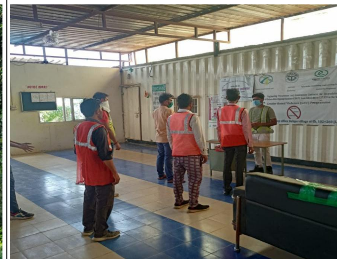
UPG-04: Ch. 102+200 (LHS) – Tool Box Meeting