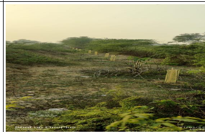
UPG-01: Tree Plantation with Tree Guard