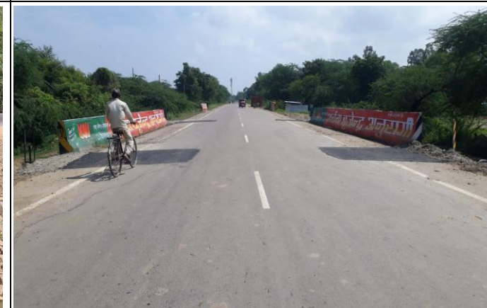
UPG-01: Ch. 68+700 (LHS) – Structure Approach Repaired