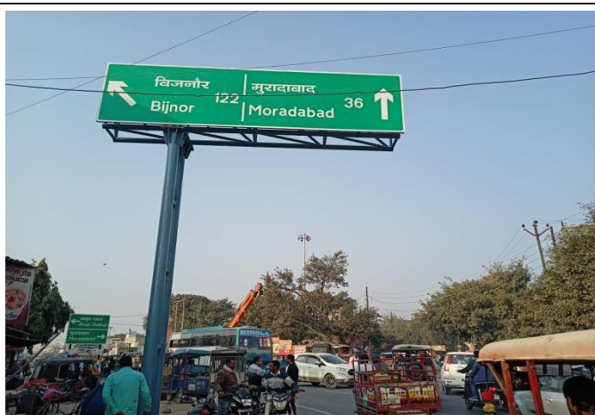
UPG-04: Ch. 89+100 (LHS) - Overhead Gantry