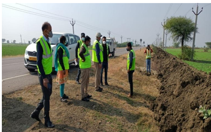
UPG-02: TL & DTL Site Visit on 10.12.2021