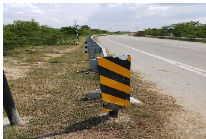
UPG-02: Ch. 125+400 (LHS) – Hazard Marker Replaced.