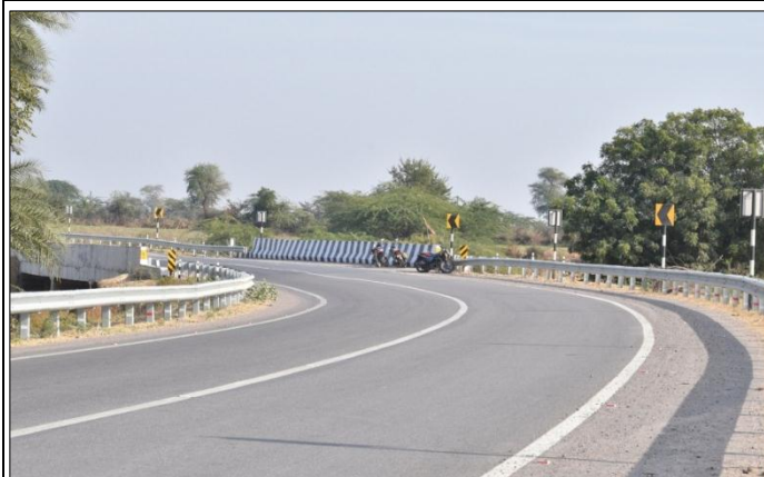
UPG-02: Ch 125+871-MBCB with Safety Sign Boards