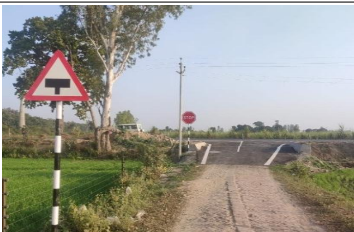
UPG-03: Ch. 16+188 (RHS) - Sign Board fixing at Minor junction