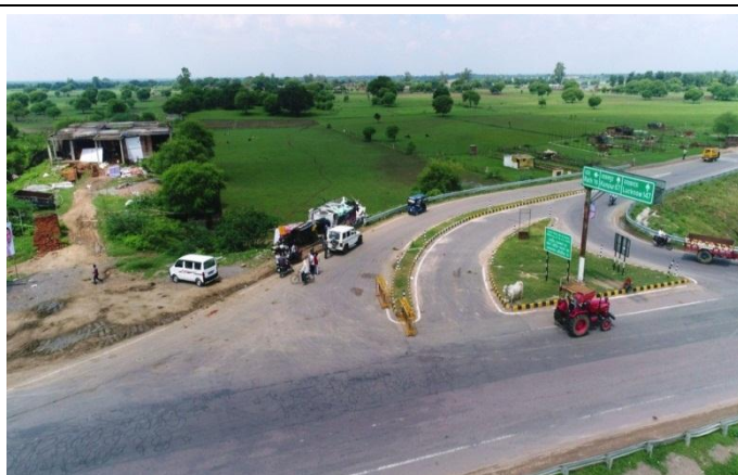
UPG-01: Major Junction Improvement with all Safety Features