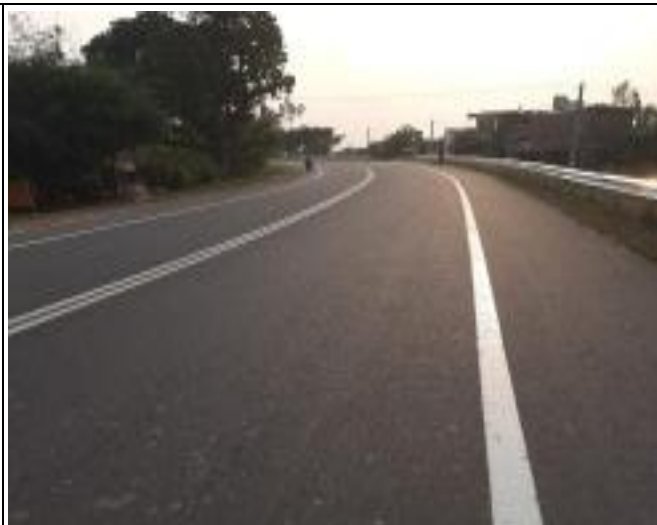
UPG-03: Ch. 21+400 – Road Marking and Metal Beam Crash Barrier Work Completed.