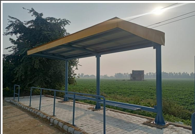
UPG-04: Ch. 118+350 (LHS) - Bus Shelter