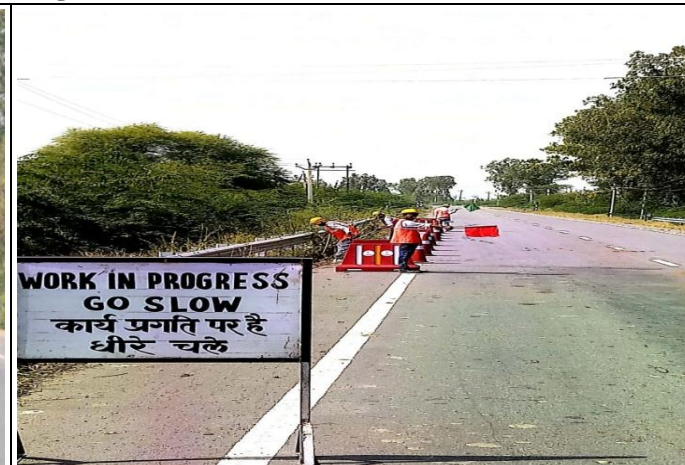
UPG-02: Ch.133+800 (LHS) - Bushes Clearance.