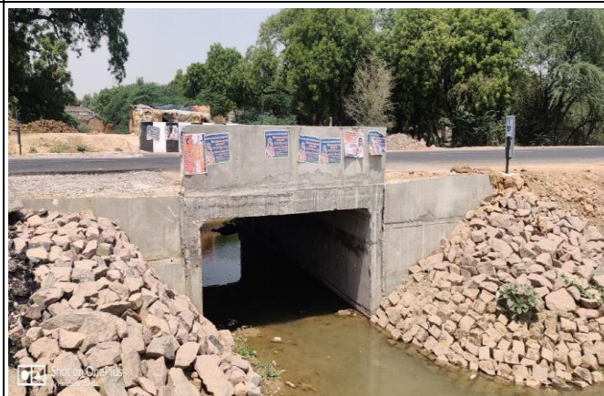
UPG-01: Ch. 5+600 (RHS) – Installation of Signage