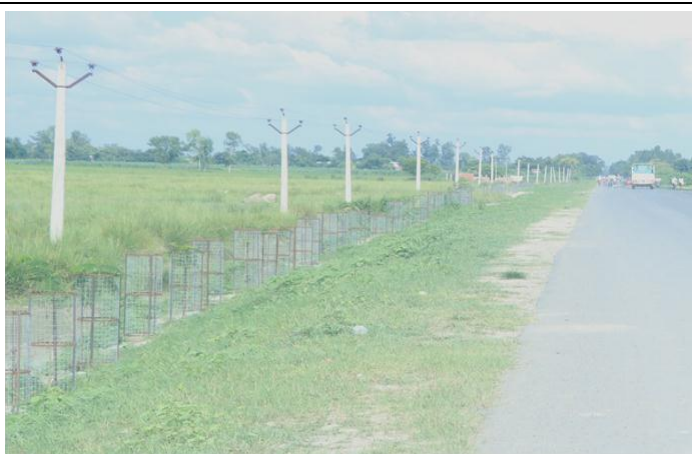
UPG-03: Tree-Guards fixed after Tree Plantation