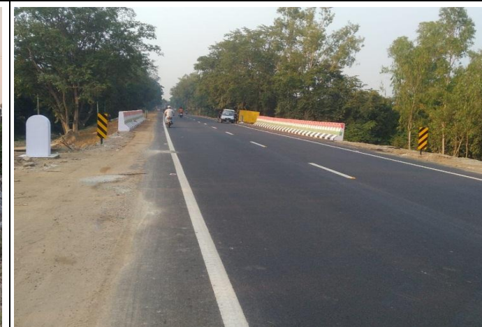
UPG-04: Minor Bridge at Ch. 130+021