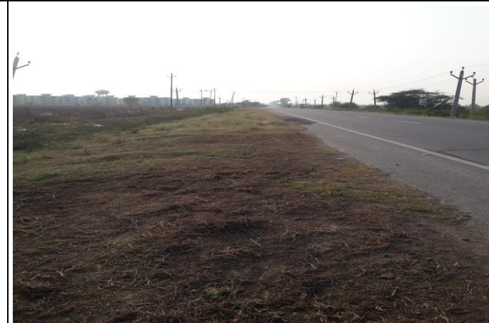
UPG-02: Ch. 124+200 (BS)- Bush Clearance Completed