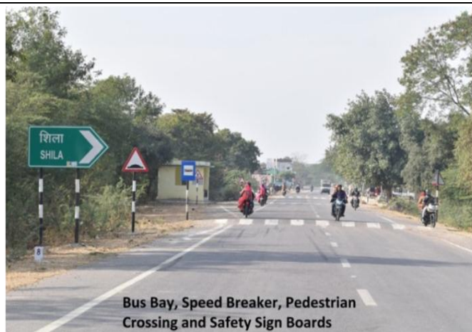
UPG-02: Bus Bay, Speed Breaker, Pedestrian Crossing and Safety Sign Boards