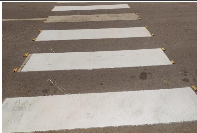
UPG-01: Ch.20+350 - Marking on MCW