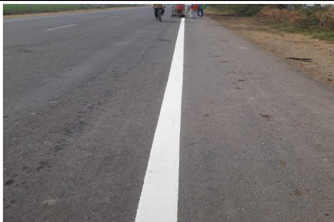
UPG-02: Ch 165+700 - Thermo Plastic Road Marking Re-Painting Work