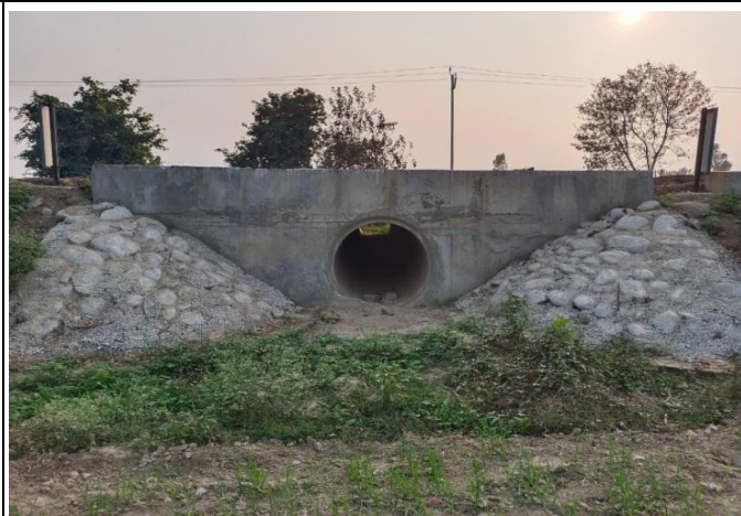
UPG-04: Ch. 100+080 (RHS) – Pipe Culvert