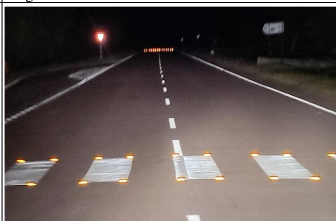
UPG-01: Night View of Road